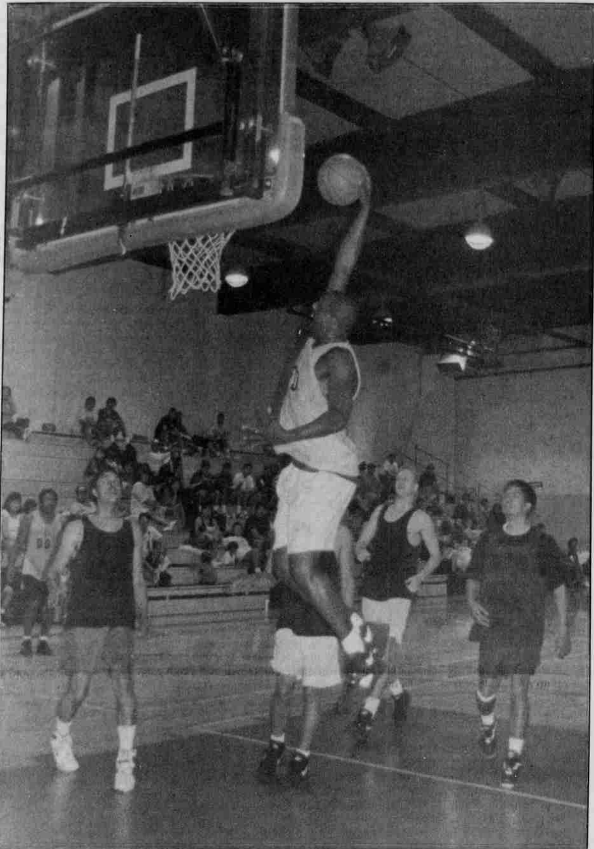
Here a dunk on the way by one of the players of the Macy's team during the championship game of the tournament.