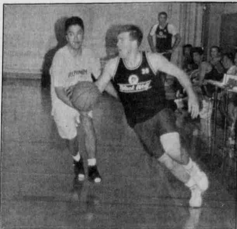
The action was fast and furious during the championship game between Macy's and Black Wolf. Here shows a Black Wolf player bringing the ball down floor at a fast pace.