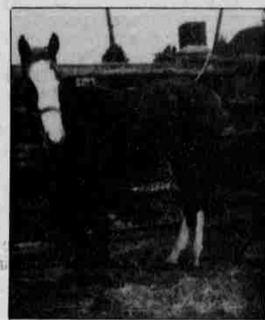
One of many raffle items is a colt.

This trip will be very educational and a lifetime experience as well as to expand my knowledge of other nationalities.