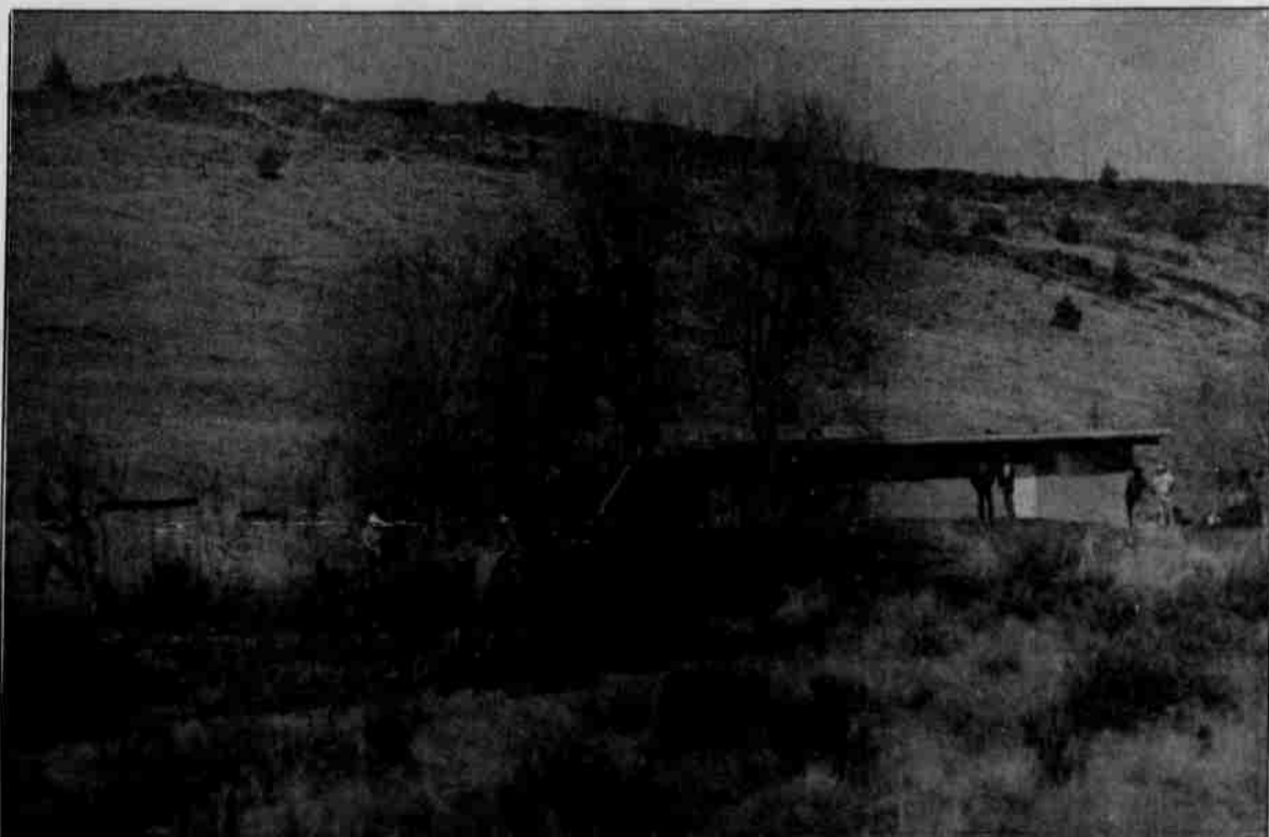
Even though it's spring time, fire danger is unusually high this year. A small fire near Miller Heights had fire crew members and neighbors jumping last week. Use caution when burning around homes and property. Be sure to obtain the necessary fire permit.

For further information contact the Central Oregon Hospice Coalition at (503) 548-7483.