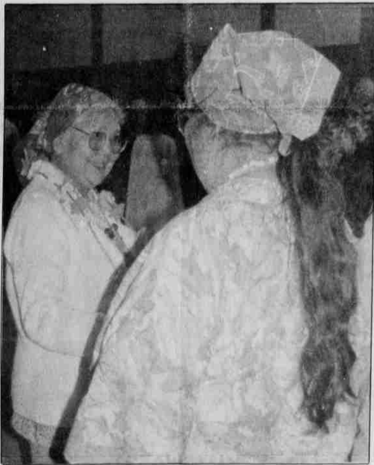
Senior citizens shook hands and gave warm greetings to each other.