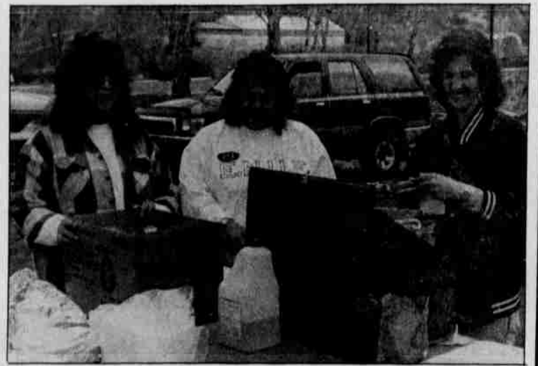
Weather was nice enough this week for outdoor cooking...

University of Oregon Libr Received on: 03-09-94 Spilyay tymoo.