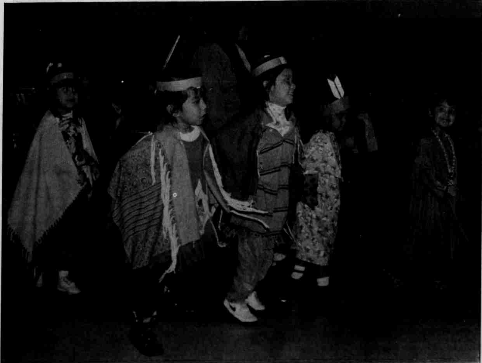
Children from the Early Childhood Education Center danced during inter-tribal of the mini powwow held at the Agency Longhouse February 11. Powwow was a warm up for the Lincoln's Birthday Powwow in Simnasho.

• Test all hot food and liquid before eating or drinking, especially if microwaved.