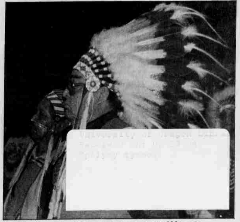
The War Bonnet Special drew out about a dozen old bonnets.