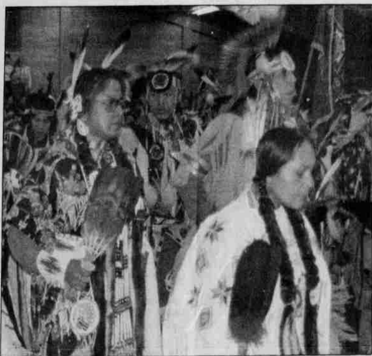
Grand entry dancers filled the floor.