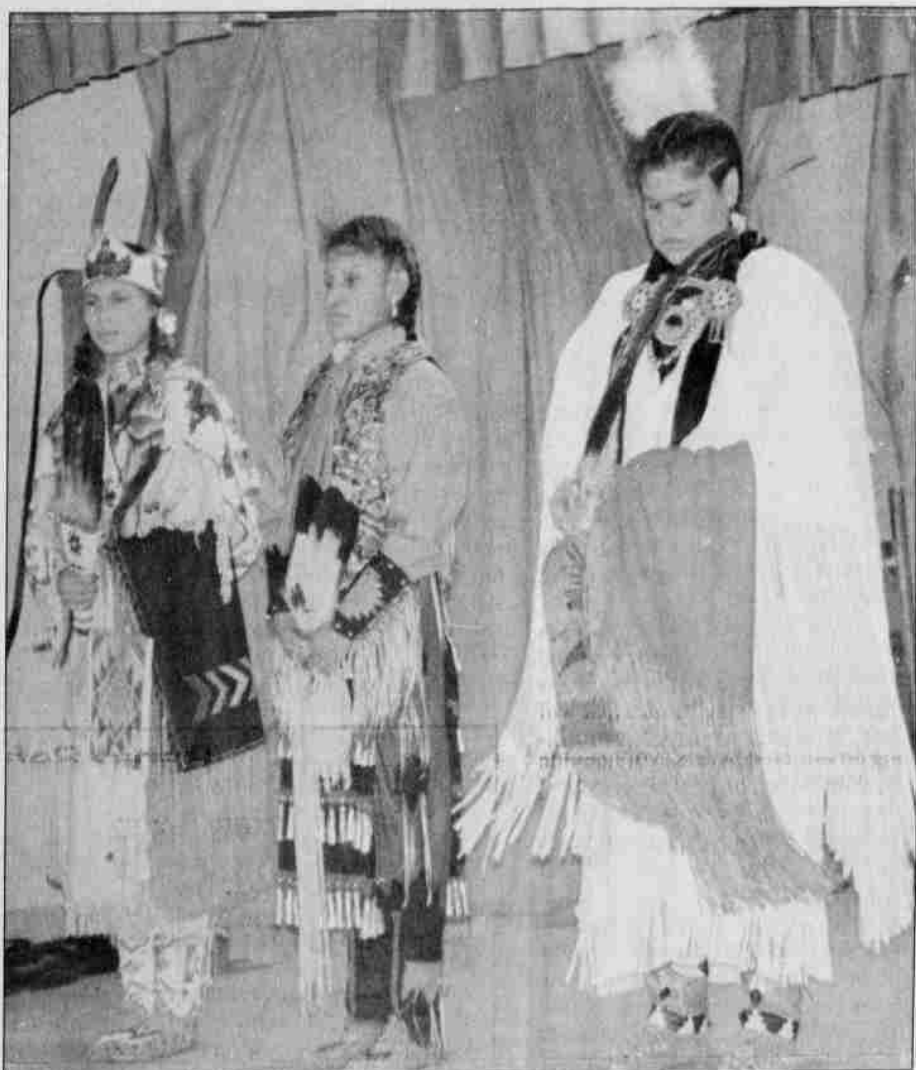
Contestants were nervous as they awaited results from the judges.

It was standing room only as three contestants vie for the title. Only one took the title home but each was a winner.