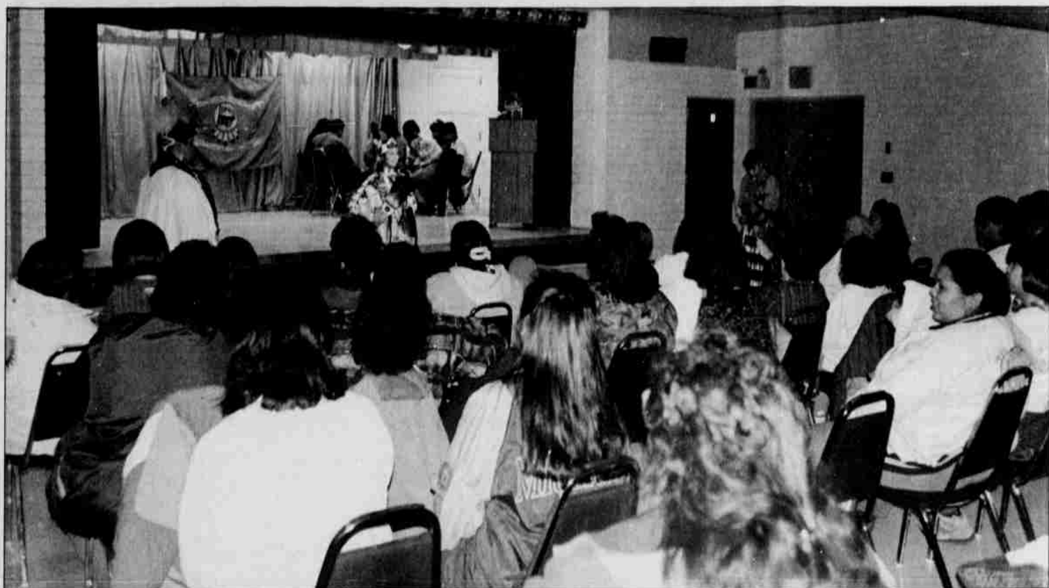
Contestants demonstrated dancing skills during inter-tribal dance.