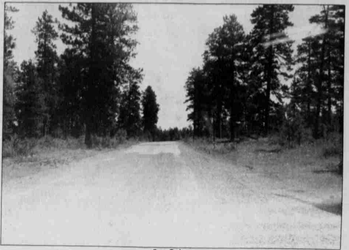
Geo-Quiz Identify the location of this photograph and win a year's subscription to Spilyay Tymoo for yourself or a friend. Call 553-1644 after 1:00 p.m. Monday, December 27, 1993 with your answer.