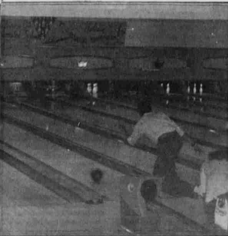
Annual Holiday Tournament time once again.