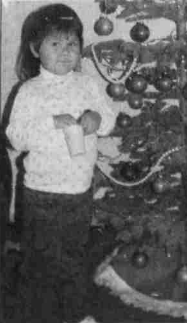
December 28 Love Always, Mom and Dad