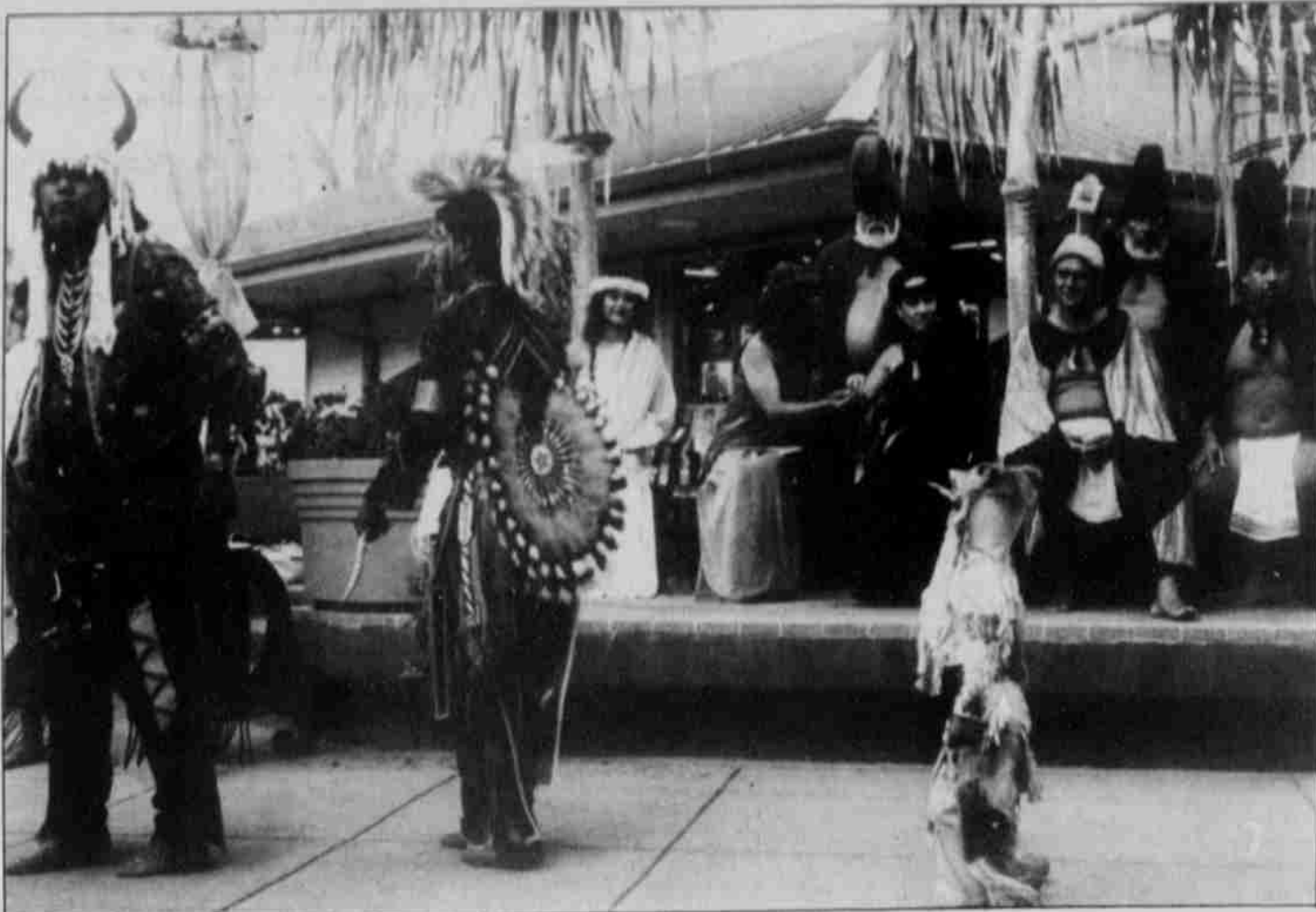
Dancers provided entertainment for Hawaiian king and entourage.

Trip takes Warm Springs dance troupe to Hawaii for week-long visit