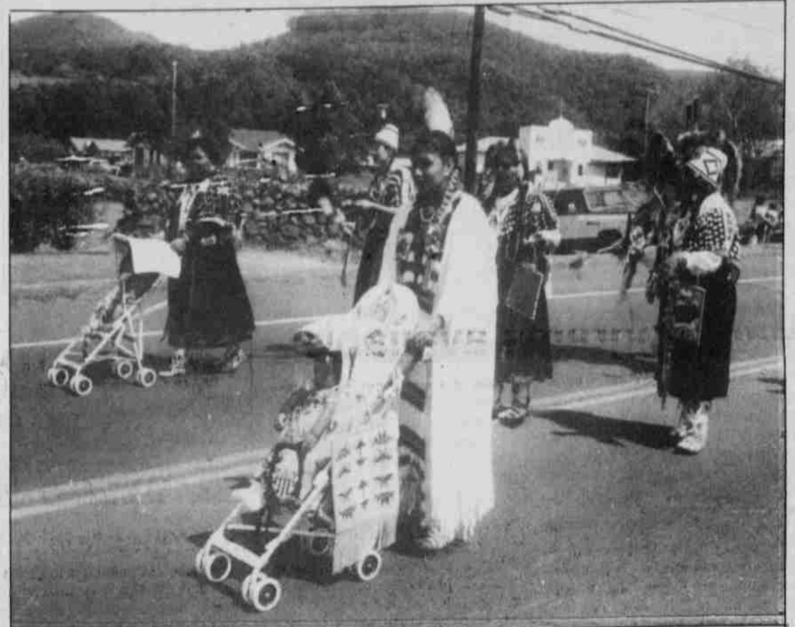
Traditional attire was worn in parade. Group garnered first prize.