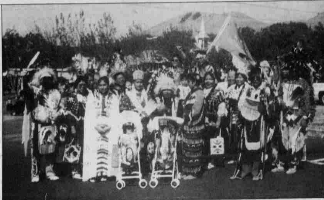
Dance troupe gathered for group photo.