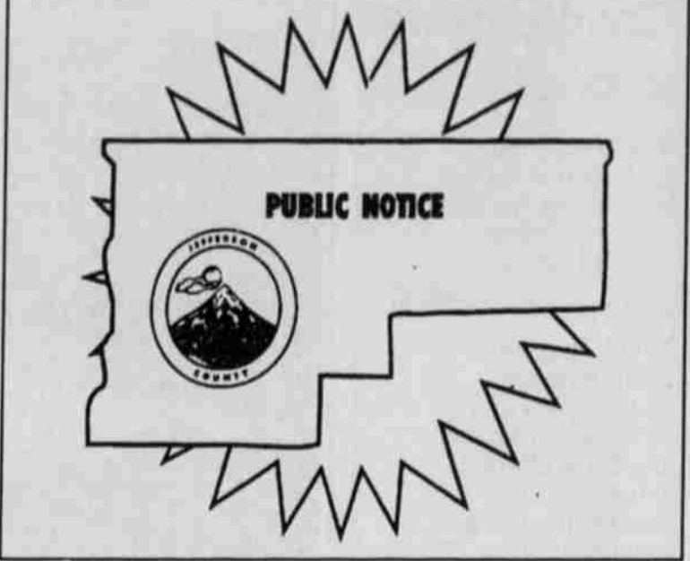
Public notice decal placed beside compliance sticker to acknowledge facility efforts.