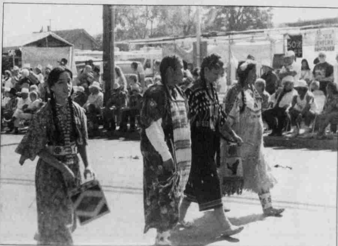
(right) Indian Beauty exiting the arena during the Indian show during the rodeo.