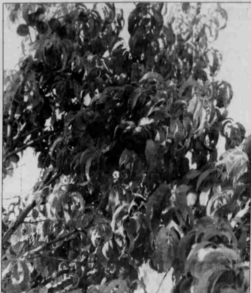
Alvis Smith, Sr.'s ten-year-old nectarine tree was loaded with beautiful, dark-colored fruit this year. Alvis says the tree has produced fruit only once before.

This summer's weather may not have been the greatest for outdoor activities, but it sure was great for gardening. The cooler temperatures and extra rainfall made for ideal growing conditions, causing gardens to produce as never before.