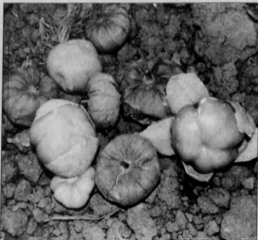
Tomatillos, great for Mexican dishes and sauces, are abundant in Merle Tewee's garden.