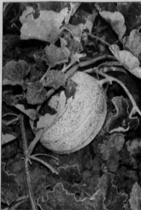
Difficult to vine ripen in other areas, Merle's cantaloupe flourished and matured this year.