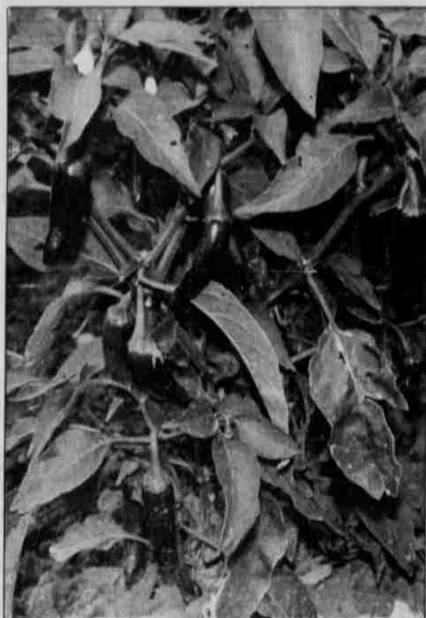
Large jalapeños, also used in Mexican cooking, are almost ready for harvest.

This summer's weather may not have been the greatest for outdoor activities, but it sure was great for gardening. The cooler temperatures and extra rainfall made for ideal growing conditions, causing gardens to produce as never before.