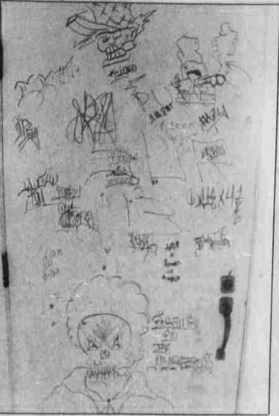
A door at the Education Center carries elaborate drawings.