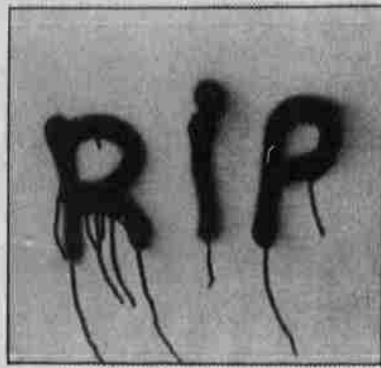
Rest in peace?

It was the day before school was to start and Warm Springs Elementary teachers and officials, while preparing for the new school year, could peer out the school windows and see the mark of gangs on the cafeteria. Scrawled on the side of the building were abbreviated warnings to rival gang members.