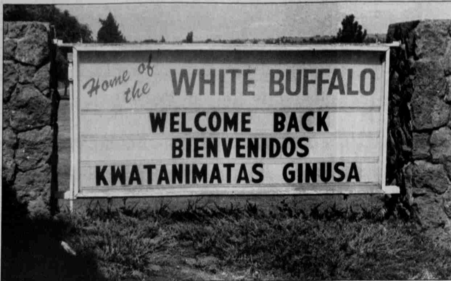
The cultural diversity at Madras High School is apparent on readerboard where students are welcomed back in three different languages.