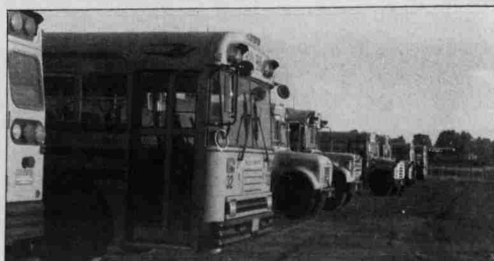
Buses warm up before first day routes begin.