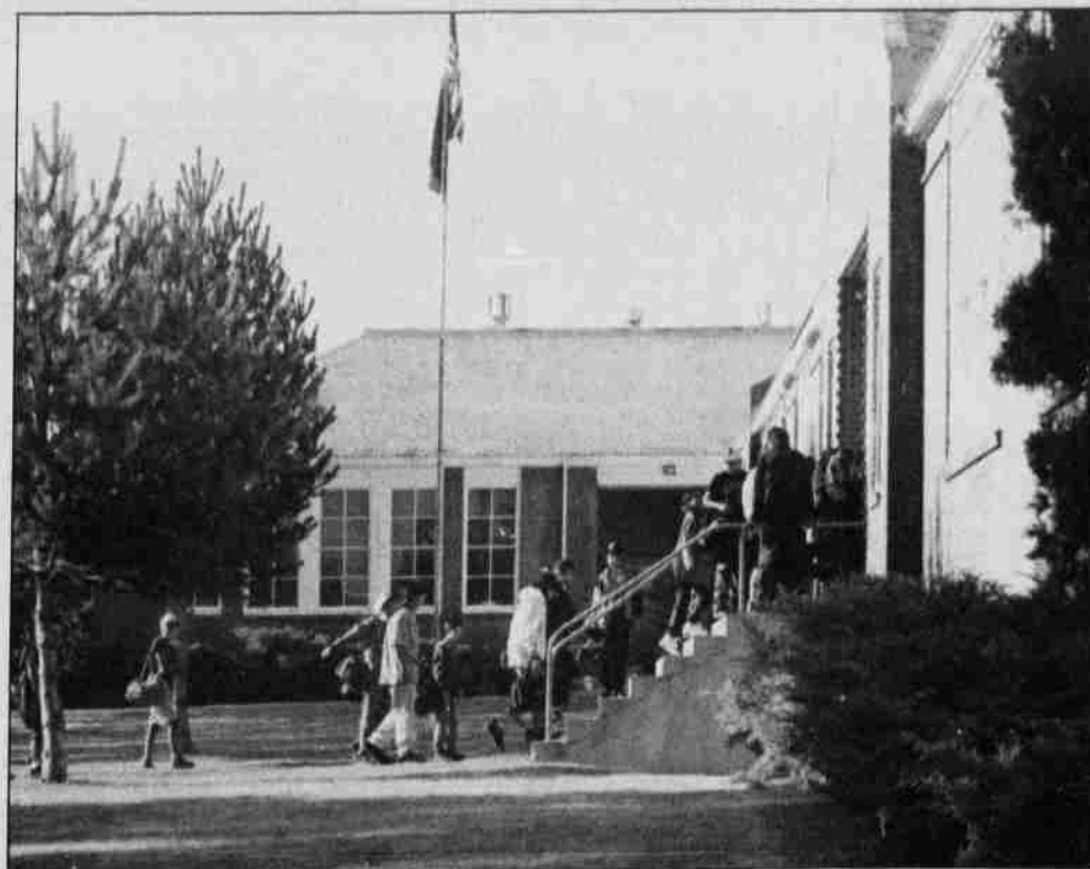
Students await the opening of MJH locked doors Tuesday morning.