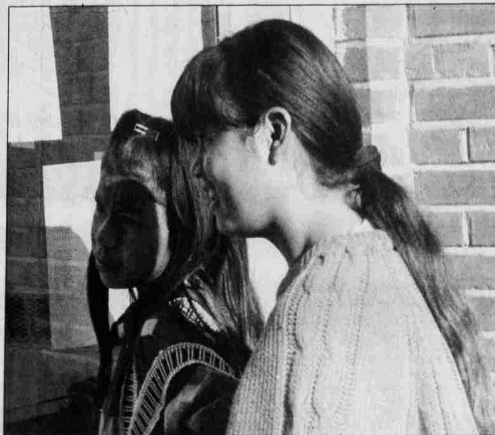
Two students anxiously check list for their names to lead them to their guide rooms on the first day at Madras Jr. High.