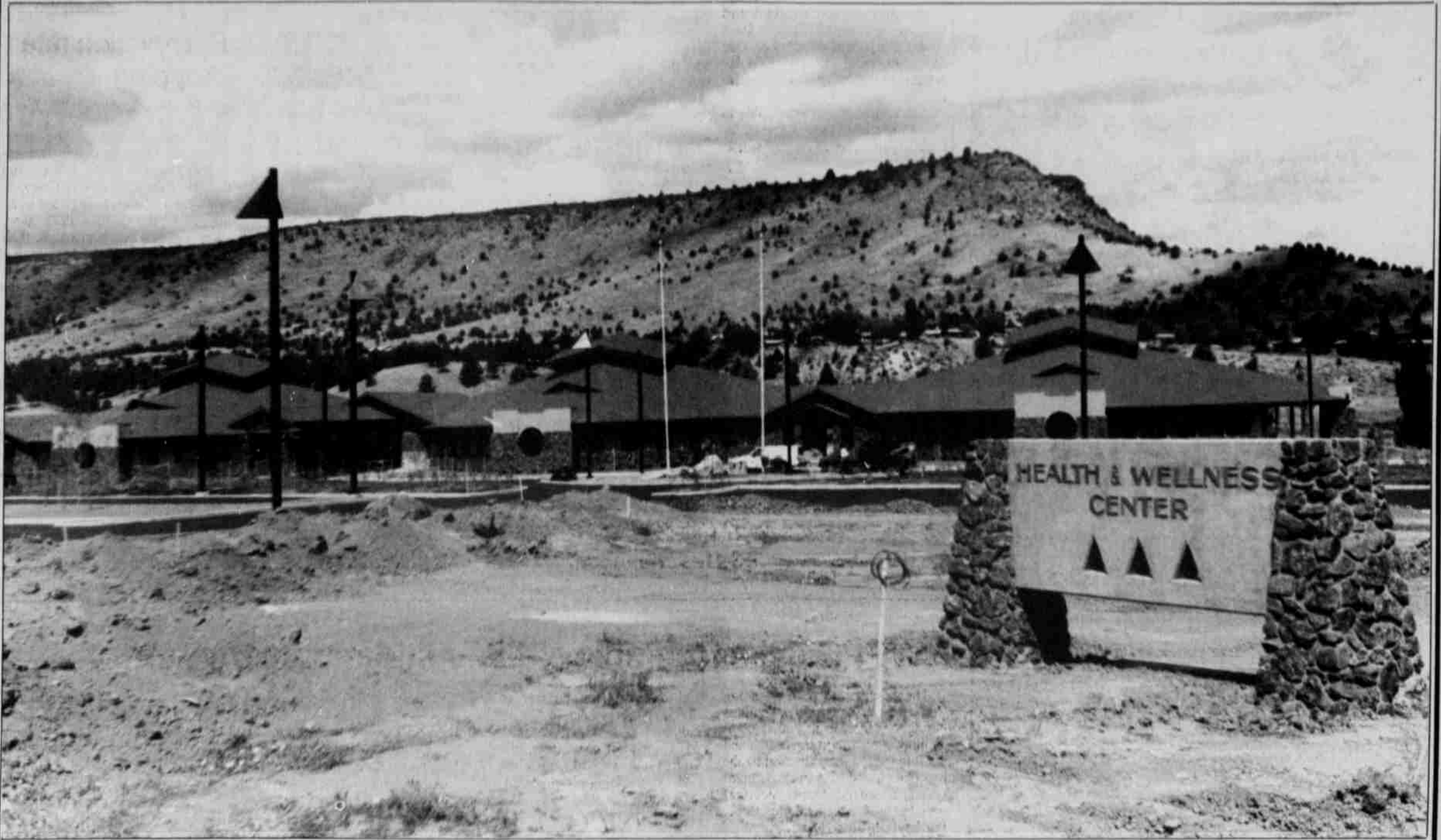
Construction of the Health and Wellness Center began July 27, 1992. It is located just off Kot-num road near the Early Childhood Education center and offers a panoramic view of Warm Springs.