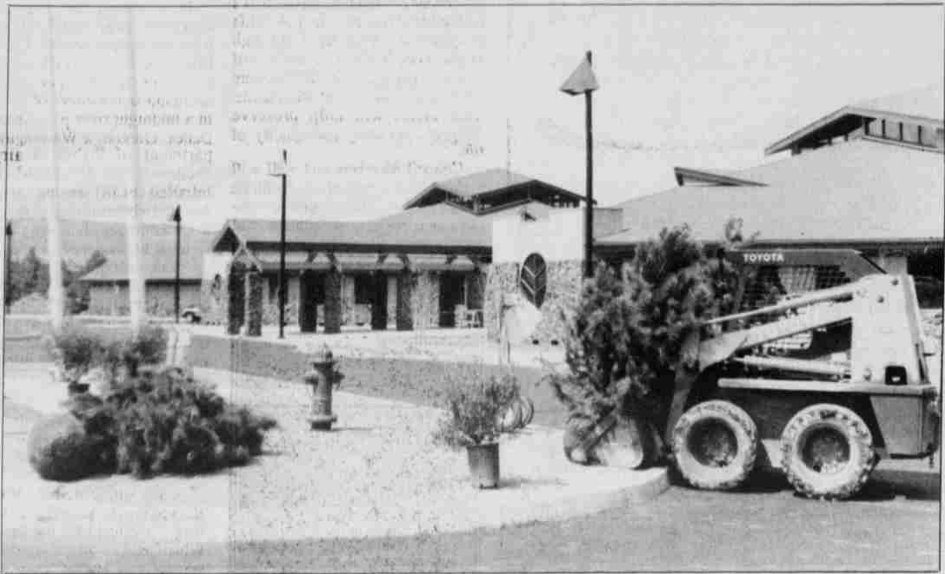
Once complete, landscaping will be extensive and include coniferous trees and other native shrubs.