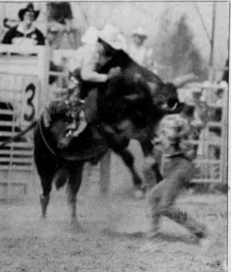
The bulls were tough on the riders during the Pi-um-sha All-Indian WSIRA sanctioned rodeo.