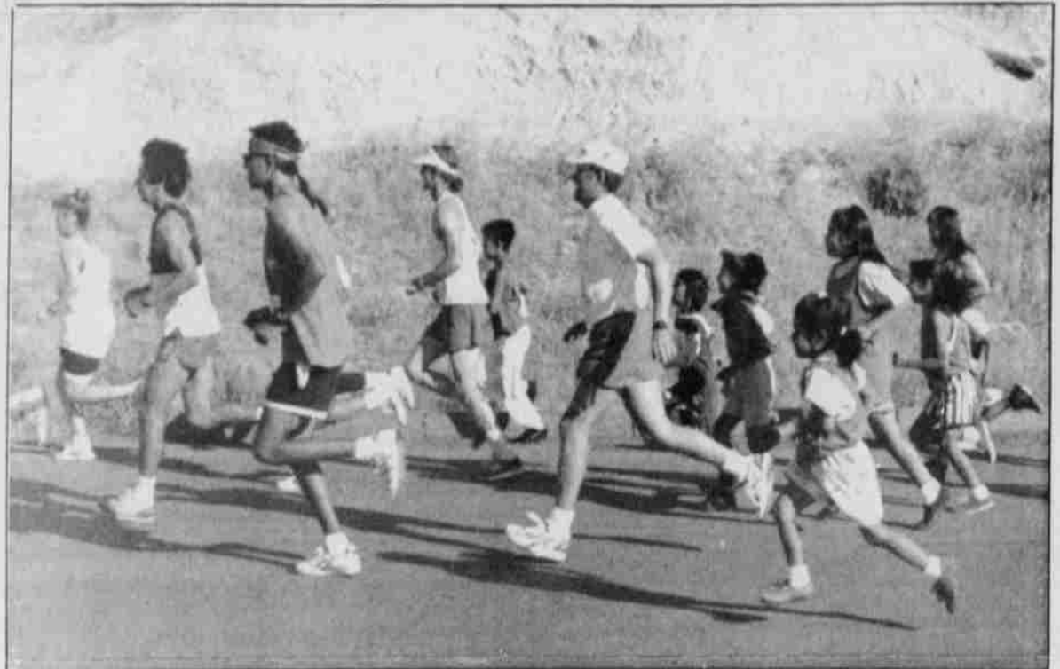
Participants of the Pi-Ume-Sha run starting line of the new flat fast course.

Warm Springs Reservation Runners held their annual Pi-Ume-Sha Run on Saturday, June 26, 1993. A total of 44 runners participated in the run, nineteen in the 10k and 25 in the 2 mile.