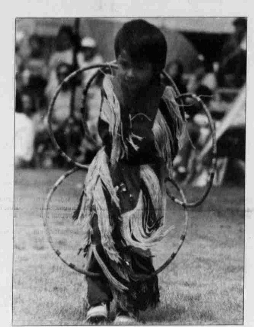
Young hoopdancer gives performance between dance contests.