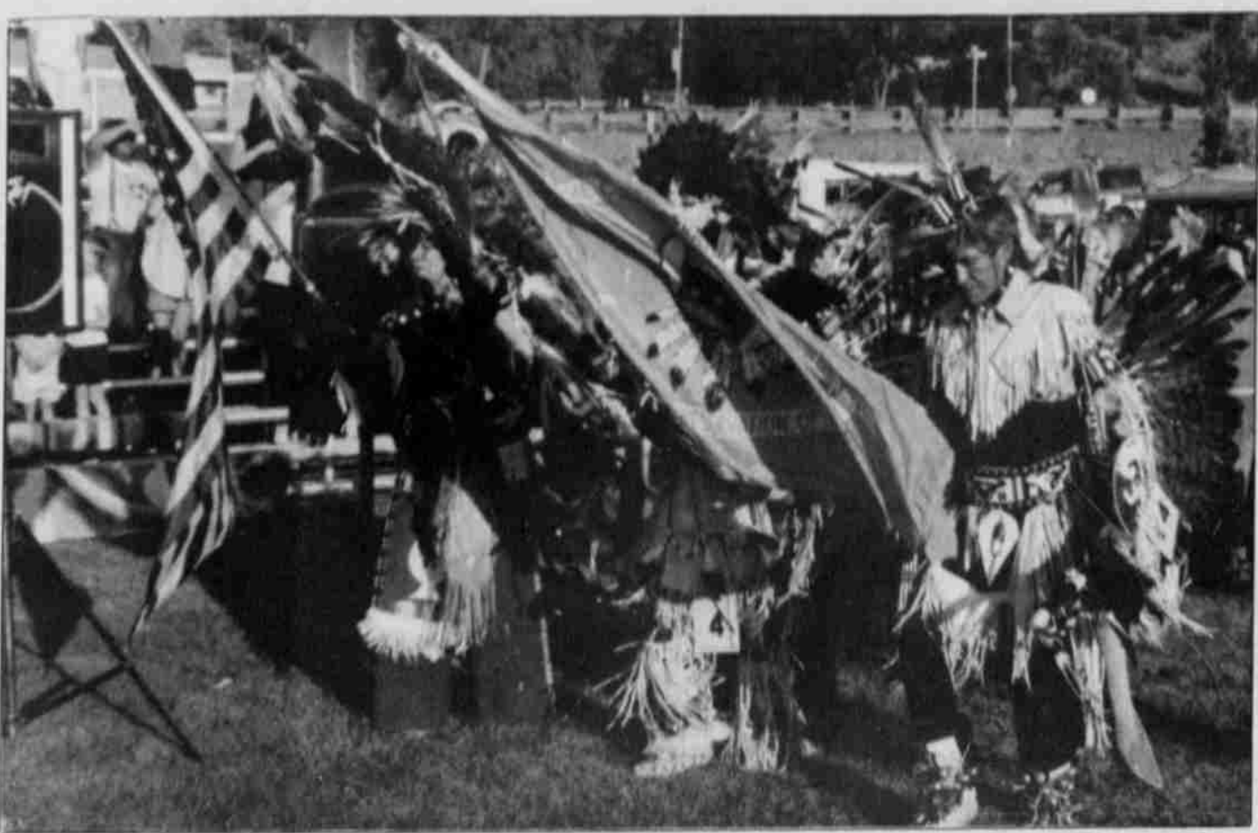
Pi-Ume-Sha celebration, drawing hundreds of participants into Warm Springs, began Friday evening with Grand Entry.