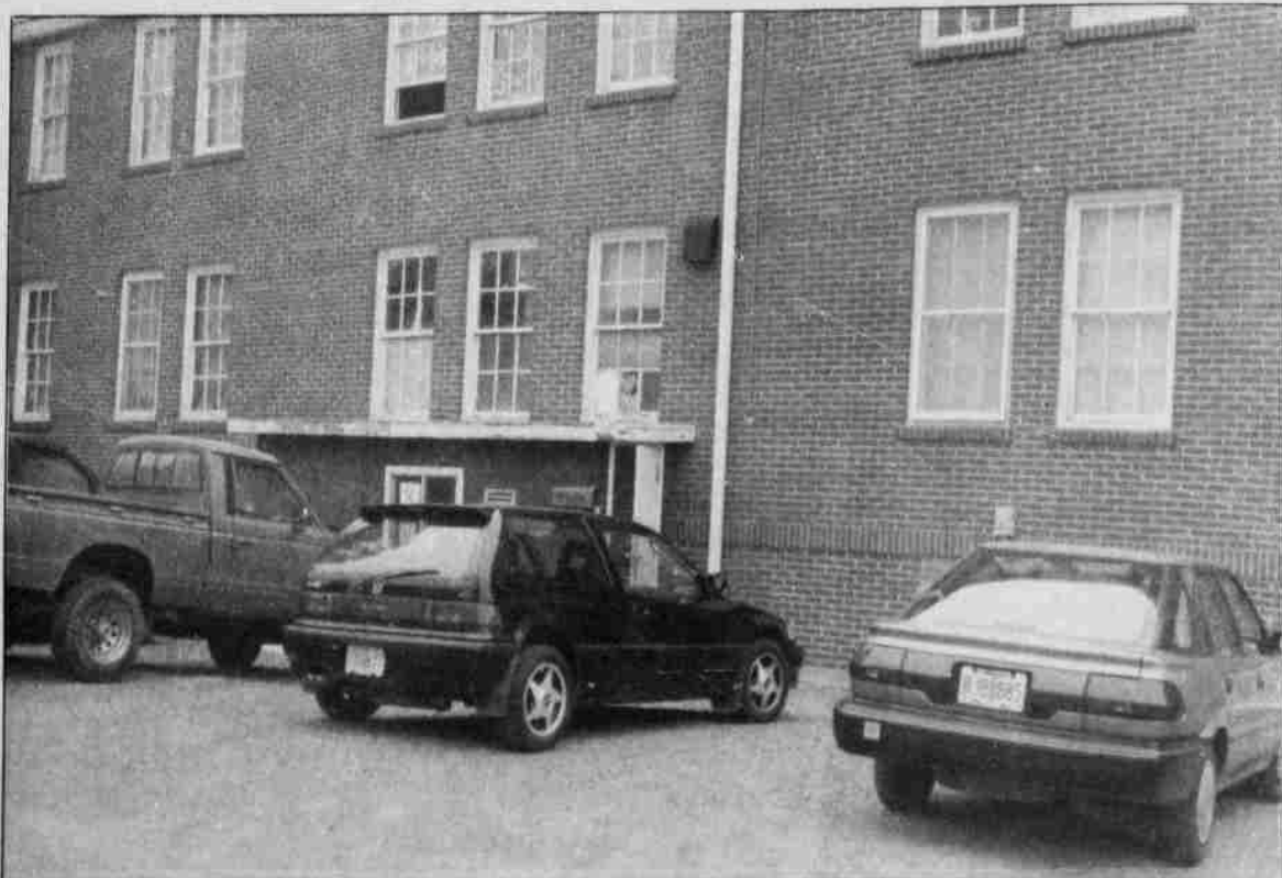
If you didn't know...

Mr. who put down the book he was about to throw. "She did?" "Christ," he said, "How I've misjudged her all these years." YIKES