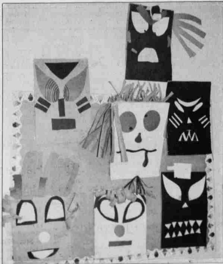
Masks were made to display the west African culture during the Multi-Cultural Fair.