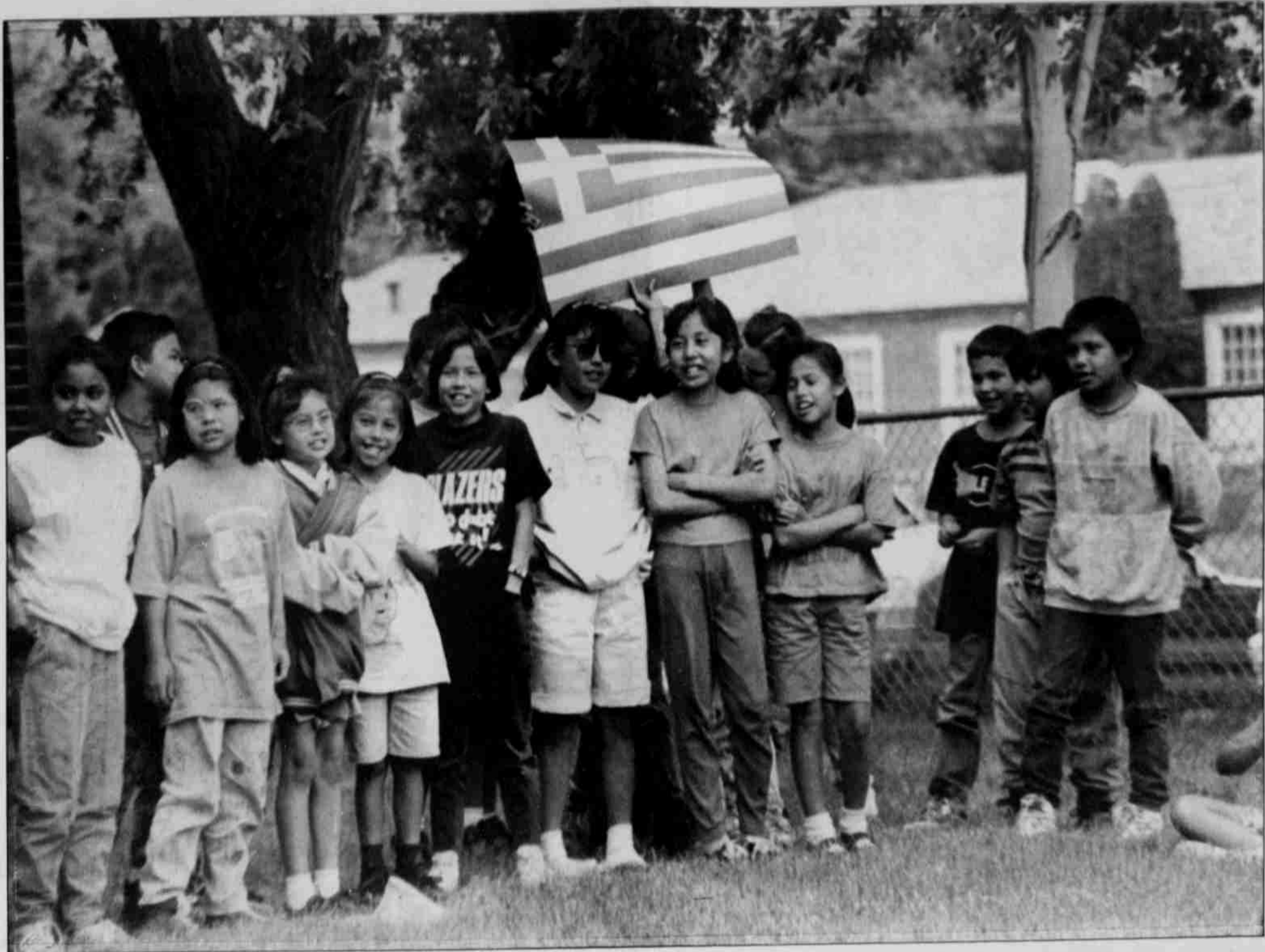
Students learned about Greek culture and sang a Greek New Years song.