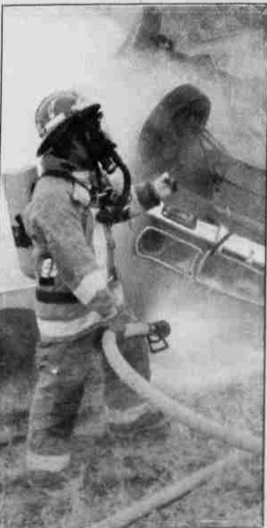
Local fire fighter helps control blaze at recent nuclear accident near Kah-Nee-Ta junction. Only time will tell if anyone was injured.

SUDS is a part of Sectional Operations Association Properties (SOAP).