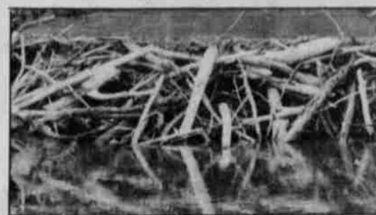
The first dam constructed by the NERDS has proved to be quite beneficial in controlling further damage by rising waters.

The company has already constructed one dam and work is underway on several others. NERDS has subcontracted with the local beaver union and other stream management specialists to complete the job in record time.