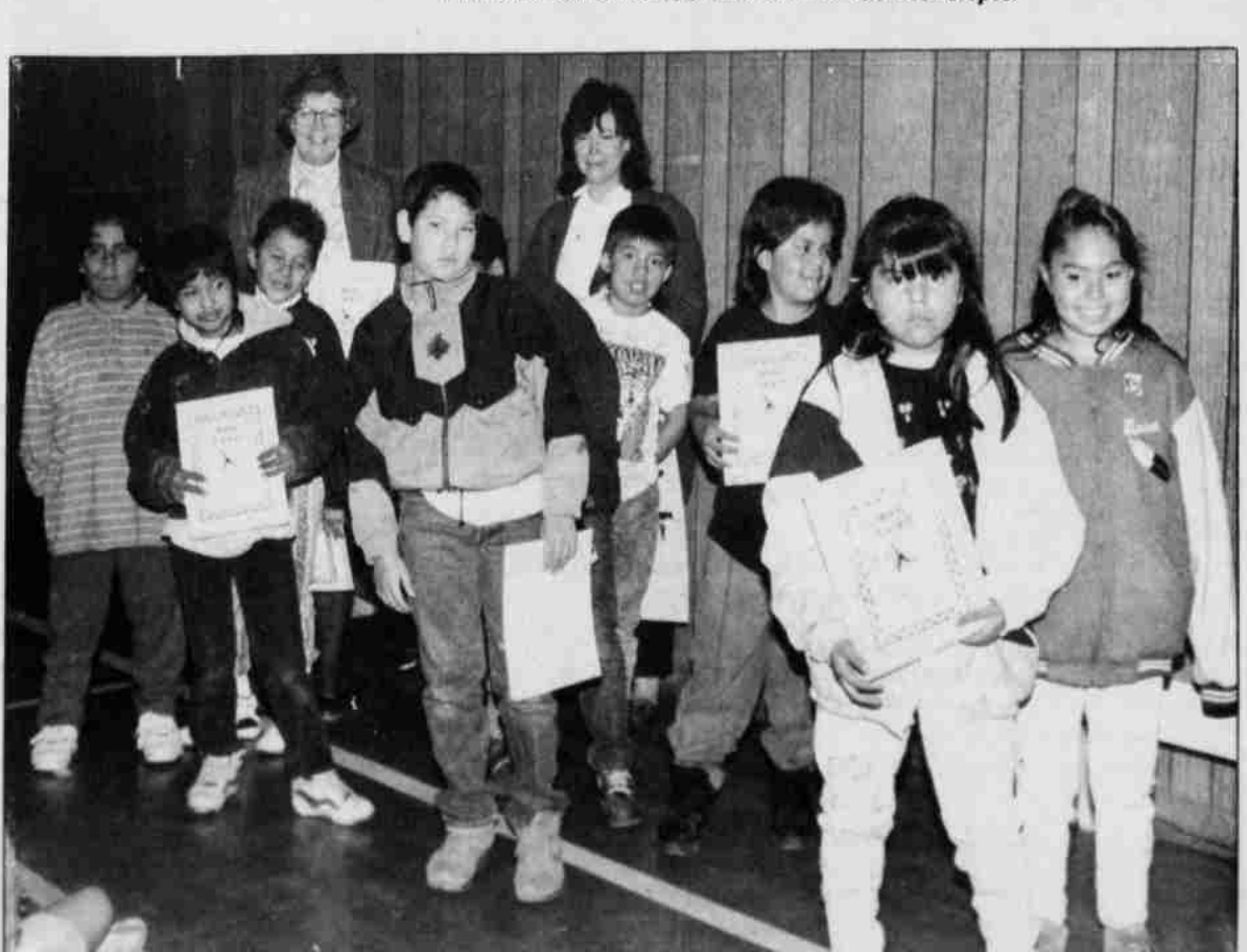
Special Olympics participants received special recognition for their efforts during the state games held at Mt. Bachelor.