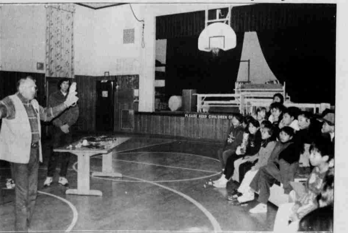
Habits and home environment of the owl and other birds of prey were discussed at a fifth grade assembly.

The High Desert Museum is located on Highway 97, south of Bend. For more information call 382-4754.