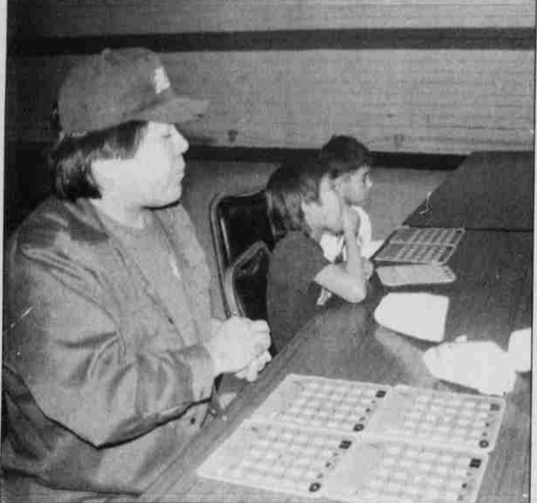
A bingo fundraiser was held March 1, 1993 at the Community Center Social Hall for the Lil' Miss Warm Springs pageant. Watch the Spilyay for future bingo fundraisers.