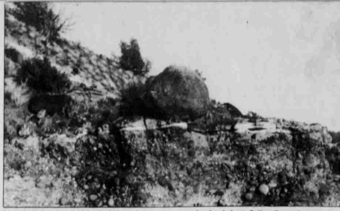
Identify the location of this geologic formation and win a year's subscription to Spilyay Tymoo for yourself or a friend. Call 553-1644 after 1:00 p.m. Monday, February 22 with your answer.

Must be able to learn to run all mowers and other small equipment in the maintenance of the golf course; and work weekends. Closing date for these positions is February 25, 1993. If you are interested in applying, please call Kah-Nee-Ta Resort 553-1112 Extension 374 for interview or submit your resume to Kah-Nee-Ta Resort, P.O. Box K, Warm Springs, Oregon 97761.