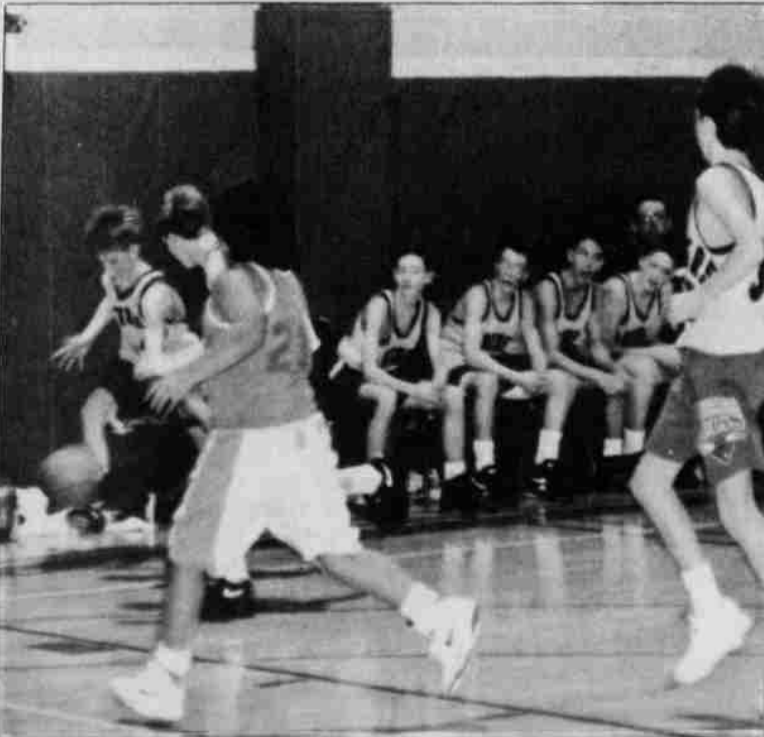
Thirteen-and-Under Tournament was held February 13 at the Warm Springs Community Center. Teams throughout Central Oregon participated.

Meetings are held the second Tuesday of each month at Terrebonne Grange Hall in Terrebonne at 7:00 p.m.