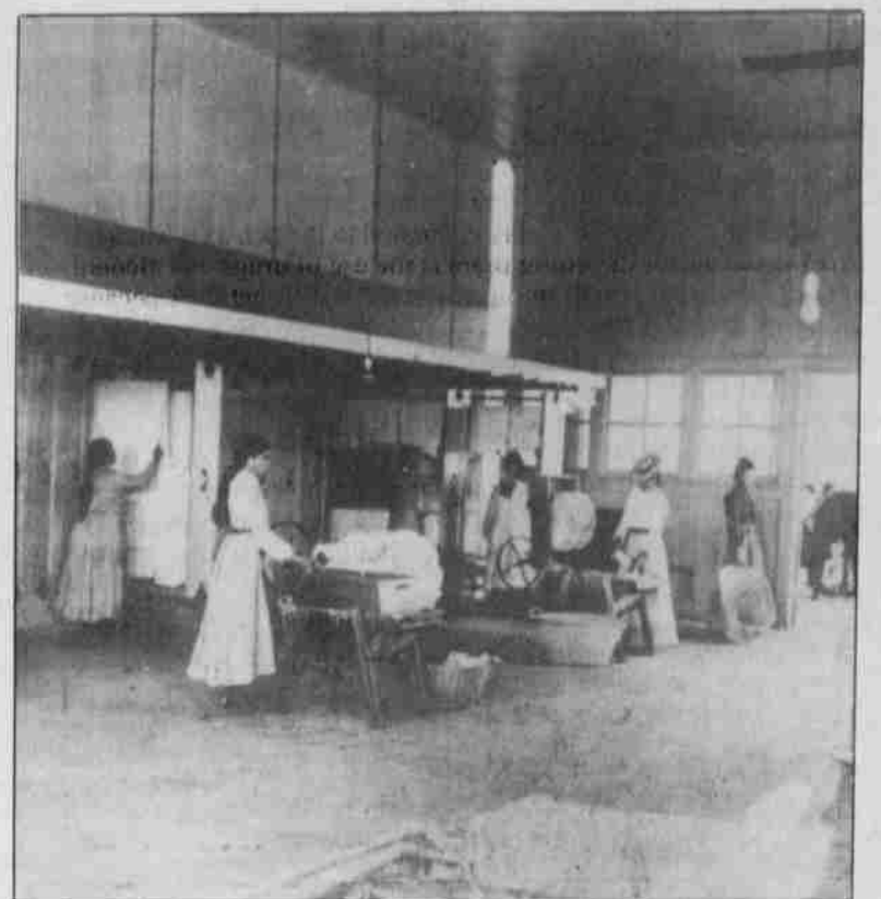
Laundering clothes was one of the duties for girls.