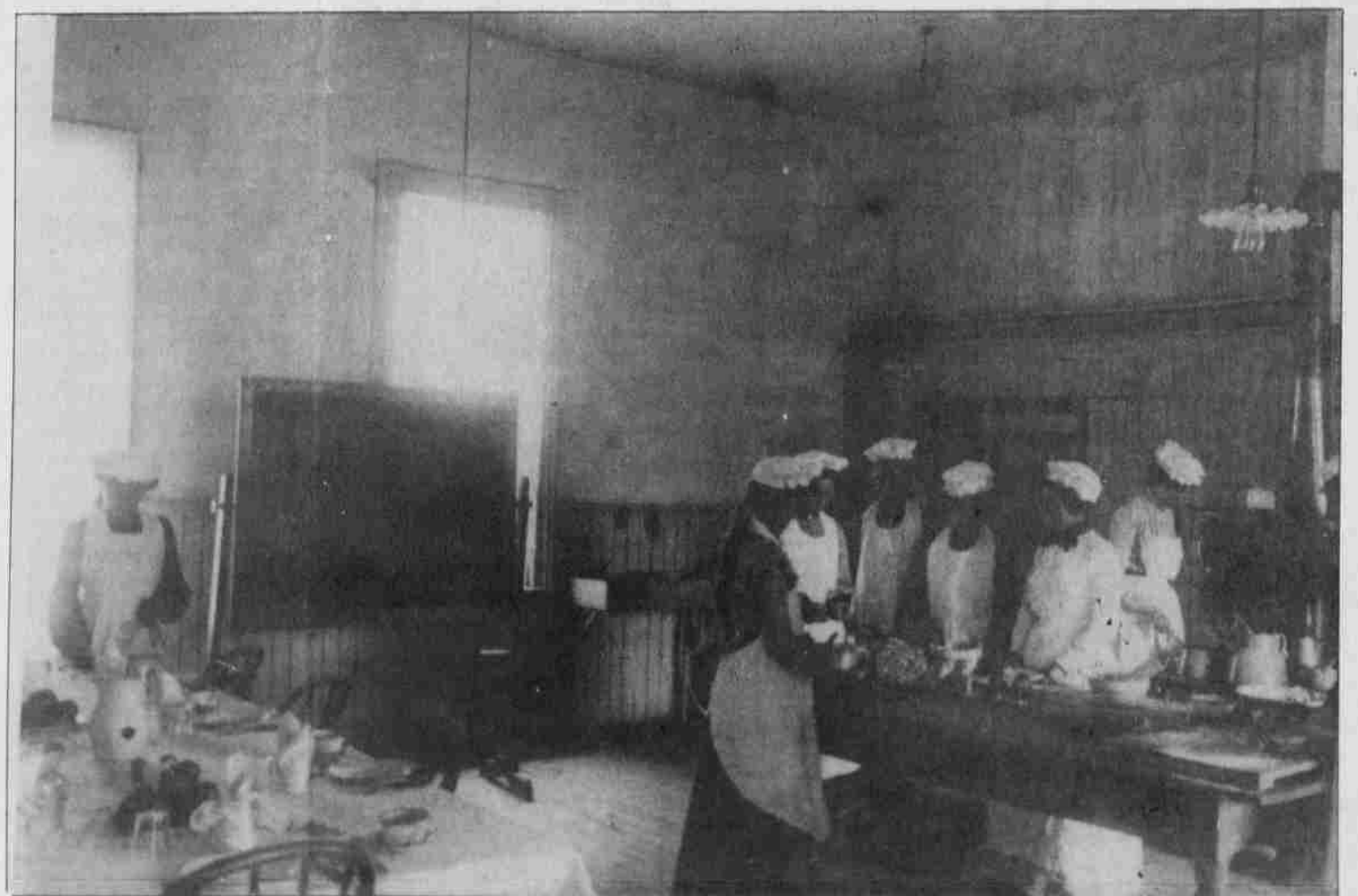
Cooking and kitchen activities were important skills to learn.