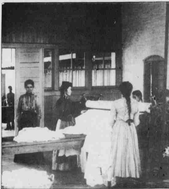
Young women learn pressing technique.