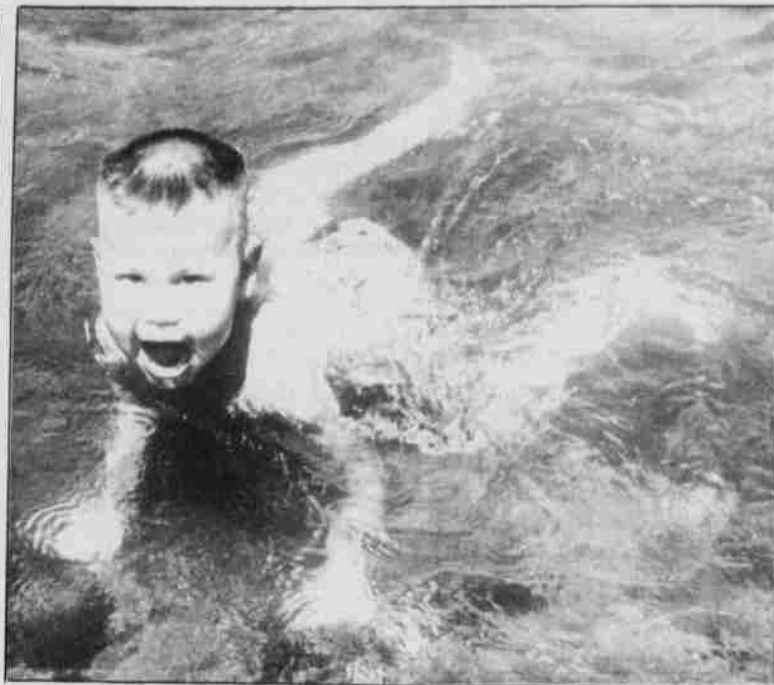
Young swimmer was all smiles at the creek.