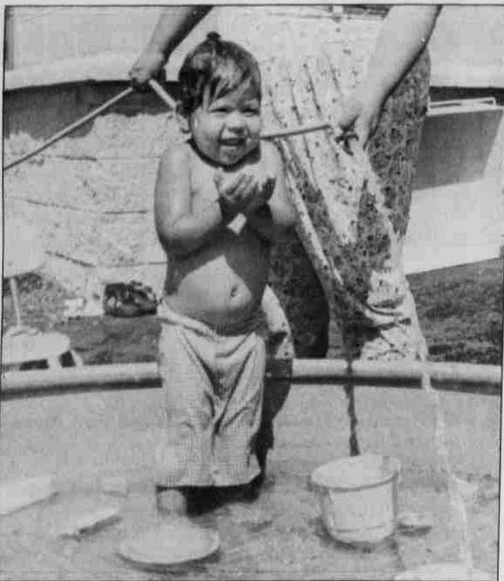
Full-day Head Start students kept their cool with the help of a hose.