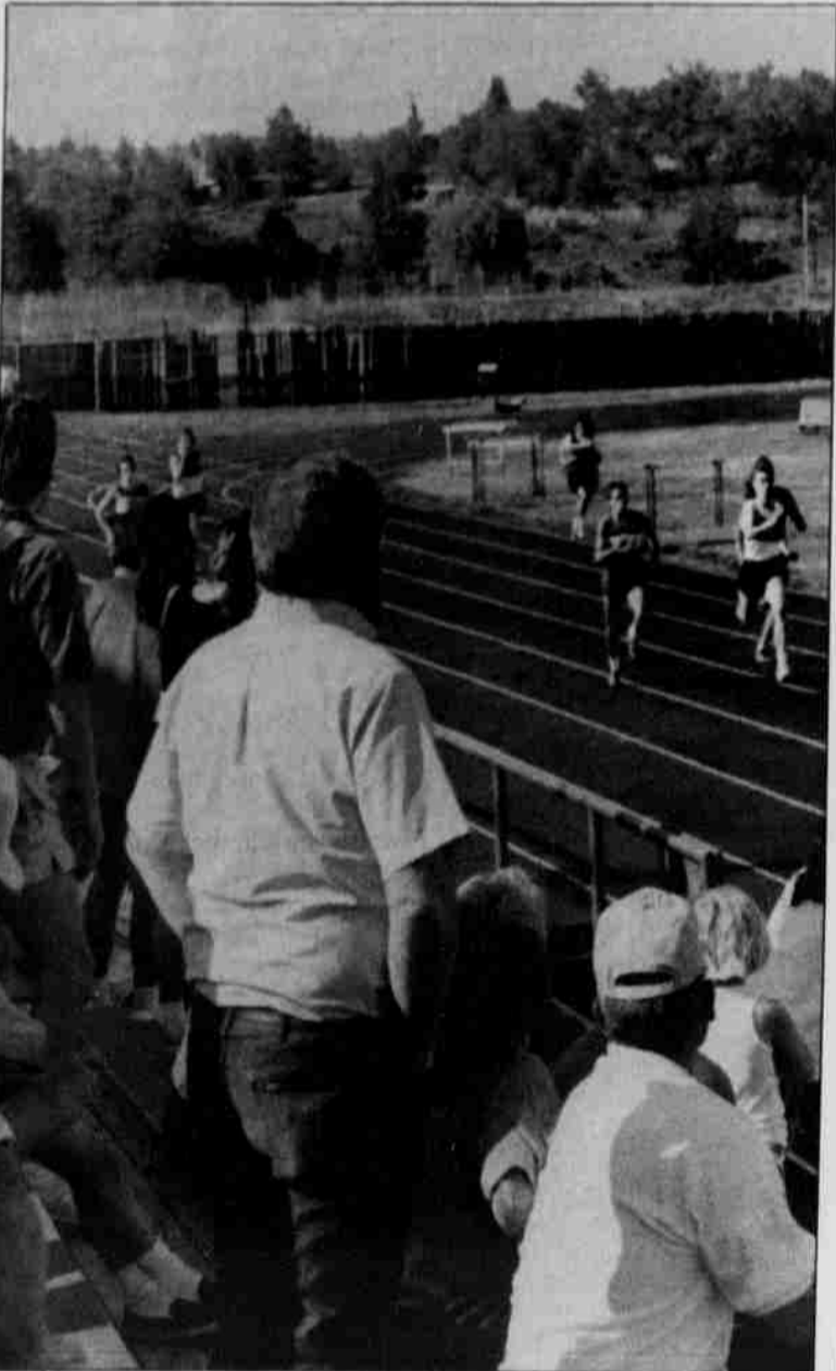
Spectators stood to catch the action during a close 200 race at District.

Long Jump: Bates, Burns, 15.11/4; second, Creekmore, Madras, 14.91/4; sixth, Badten, 14.21/2; High Jump: Henes, Baker, 5.4; Trindle, Baker, 5.4; fourth, Hawes, Madras, 4.10; Javelin: Dobson, Burns, 133.5; Thomas, Burns, 94.9; Discus: Shipp, Nyssa, 103.111/2; Troyer, MacHi, 97.2; sixth, Bushlach, 81.71/2; Shot Put: Behrend, Madras, 35.51/2; Bushlach, Madras, 32.91/2; fourth, Badten, Madras, 30.31/2.