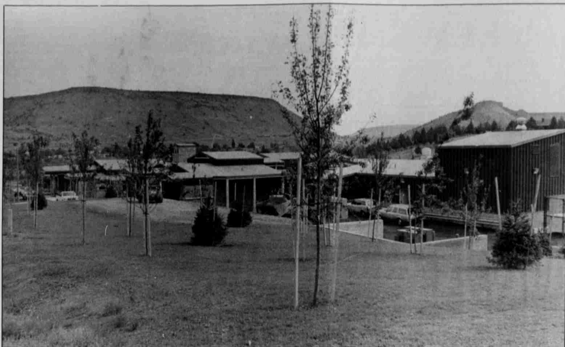
The new Early Childhood Education Center is located south of the Agency Longhouse near what was once the Warm Springs landfill.