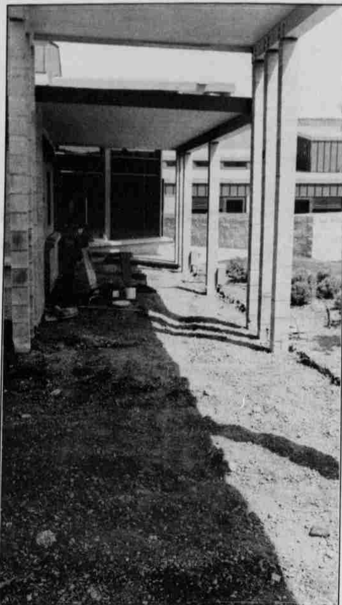
A faulty sidewalk will be replaced before the Center opens.