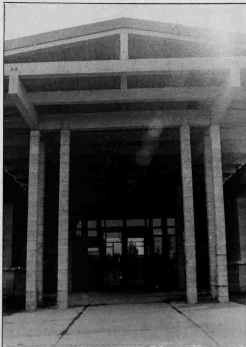
The halls of learning for Warm Springs children will open May 18.