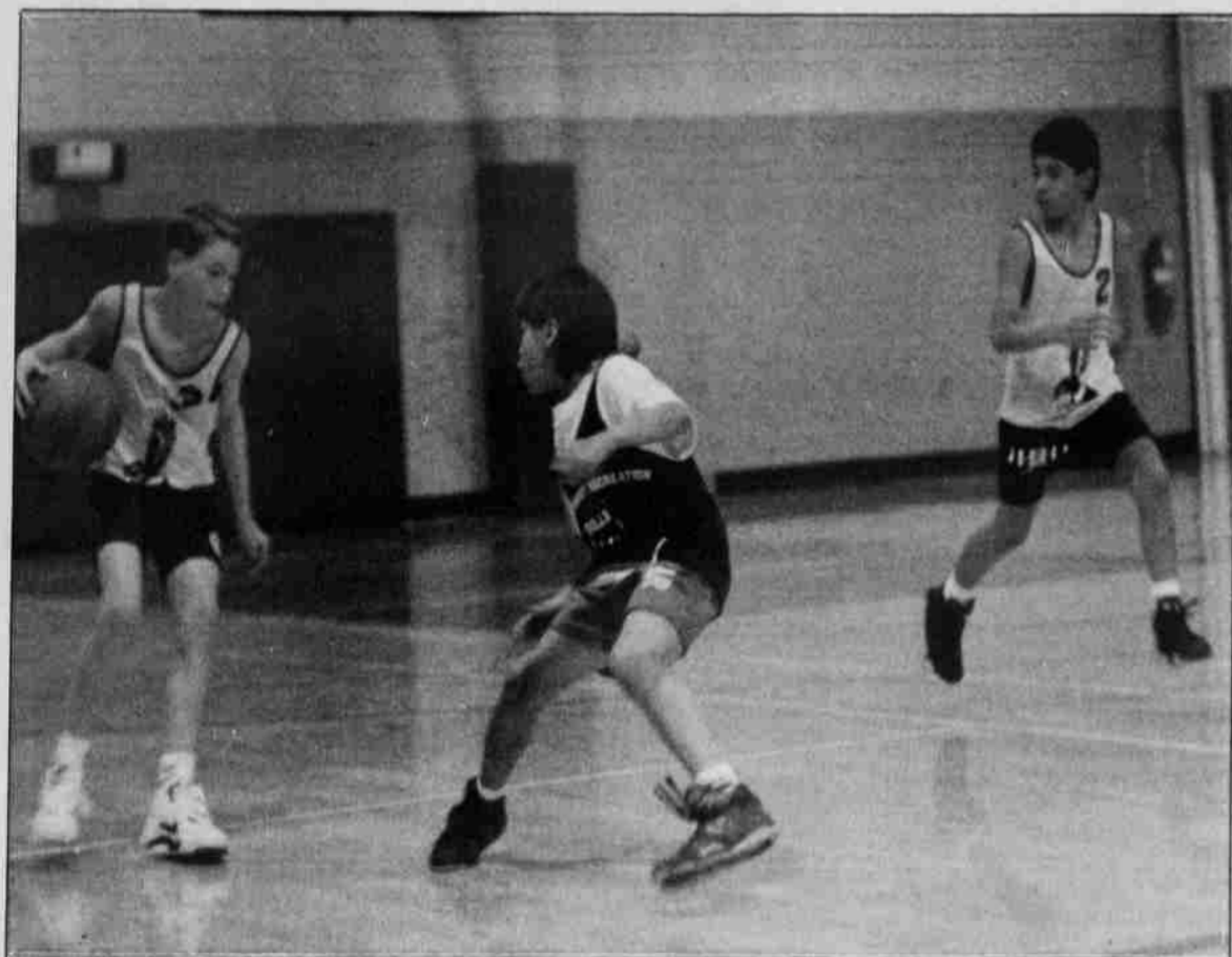
Some of the action during the We B.A.A.A.D. (Battle Against Alcohol And Drugs) 13 year and under tournament at the Community Center.