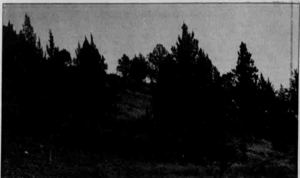
Geo-Quiz Identify the location of this Geo-quiz photograph and win a year's subscription for yourself or a friend. Call 553-1644 with your answer after 1:00 p.m. Monday, February 24.