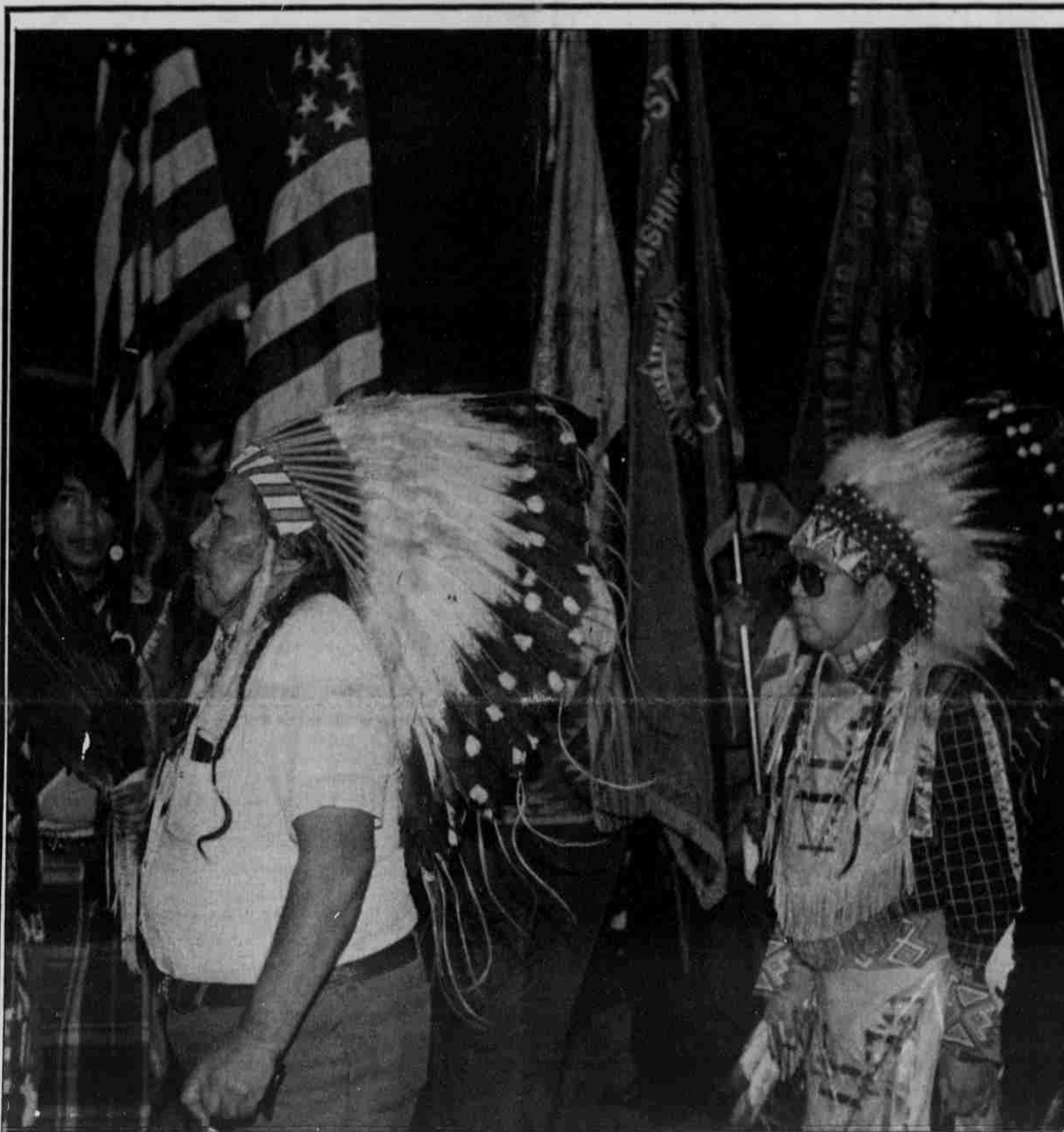
Warriors lead Grand Entry

Tribal Council Elections In March Watch for signs announcing dates of District Meetings