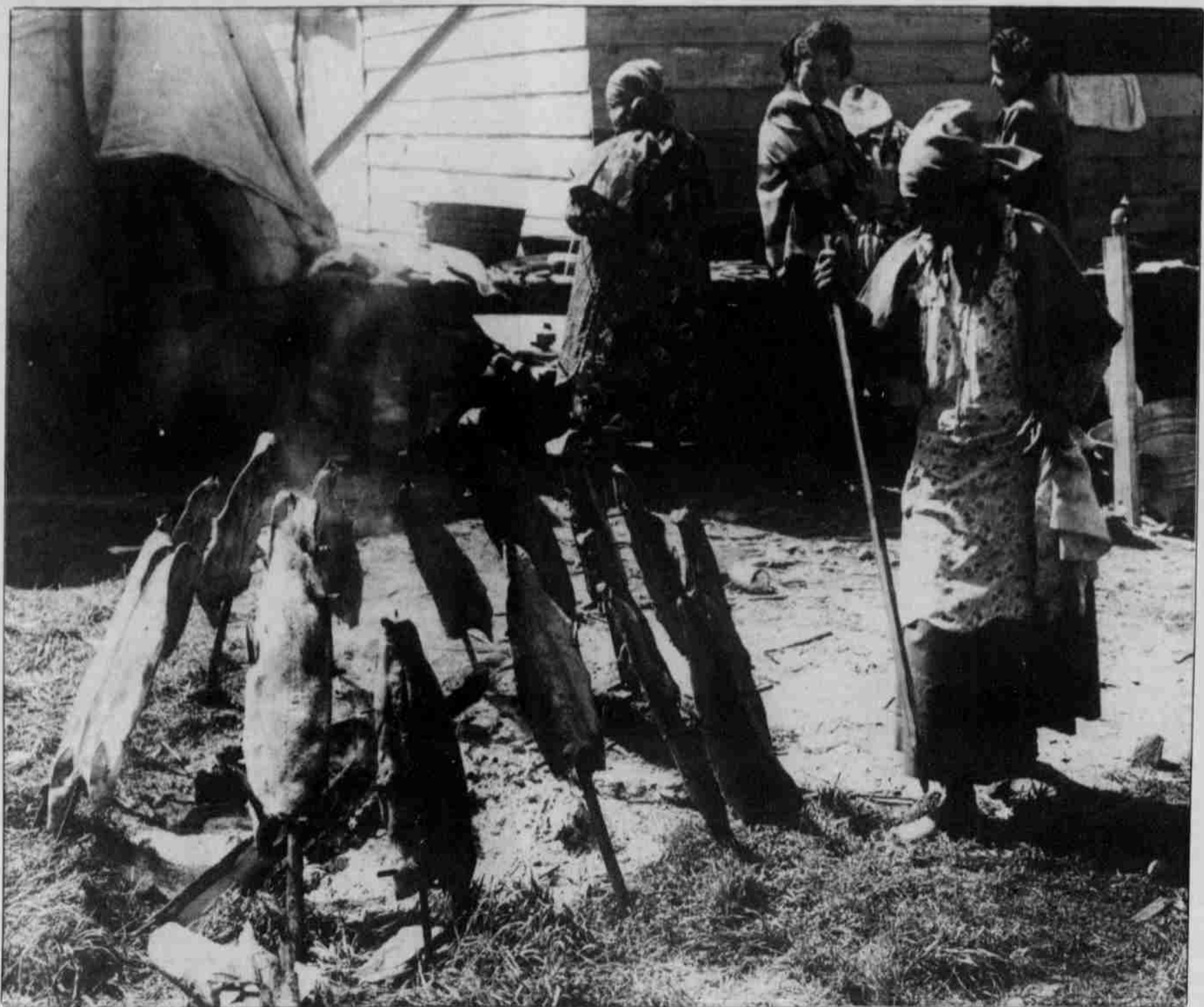
Last Salmon Feast-Celilo-April 24, 1954