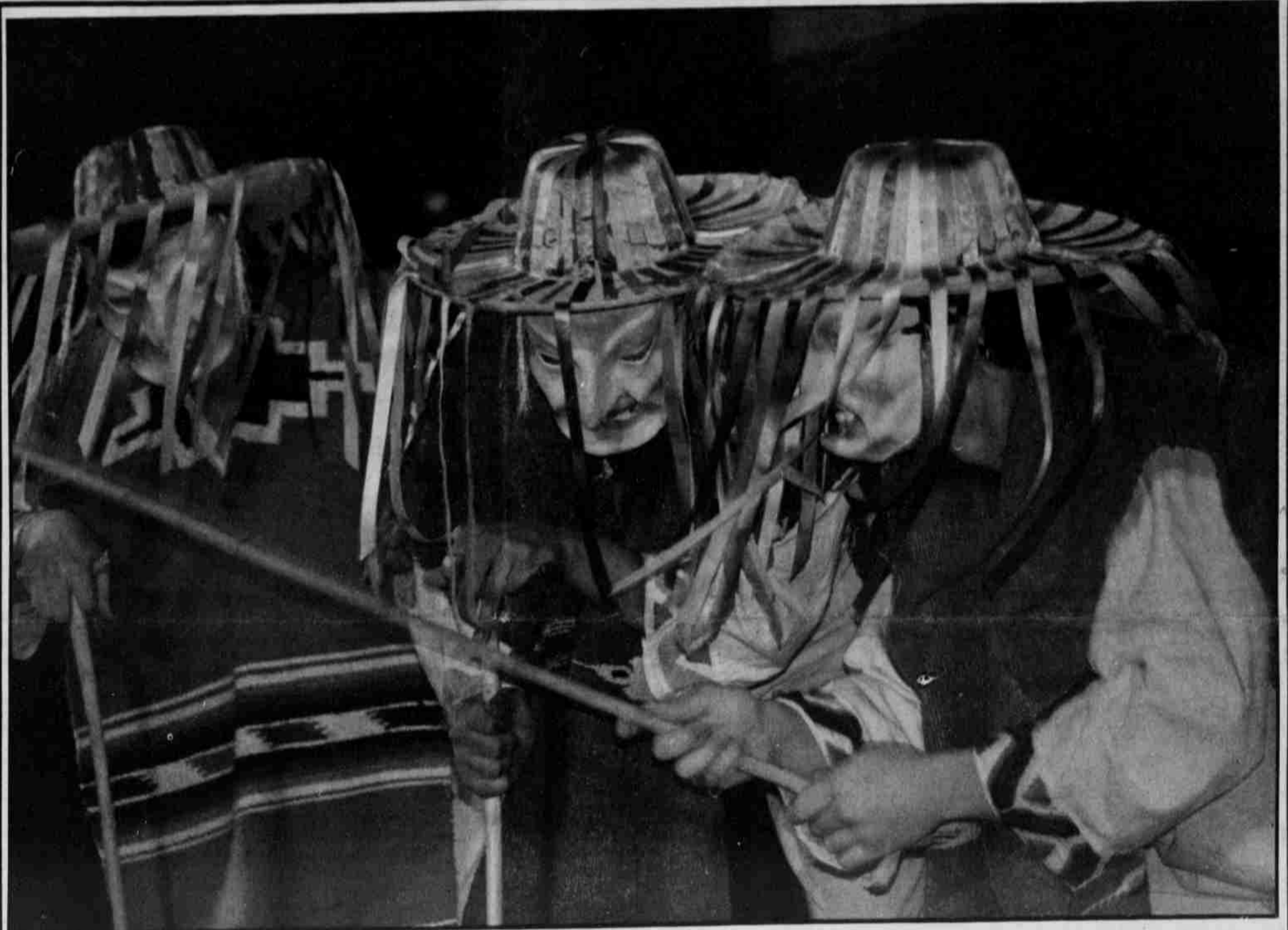
The Dance of the Old Men entertained the audience at the Lamanite Generation presentation February 4 at the Community Center.