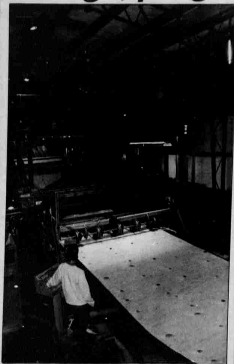
The WSFPI veneer plant closed down its operations October 22 after more than two decades of operations. Initially, 115 employees were to be laid off as a result of the shutdown, but as of December 13, 91 workers had been notified of their layoff that would be effective December 31.

Warm Springs, along with the rest of the nation, tolerates the only thing constant in our lives--change