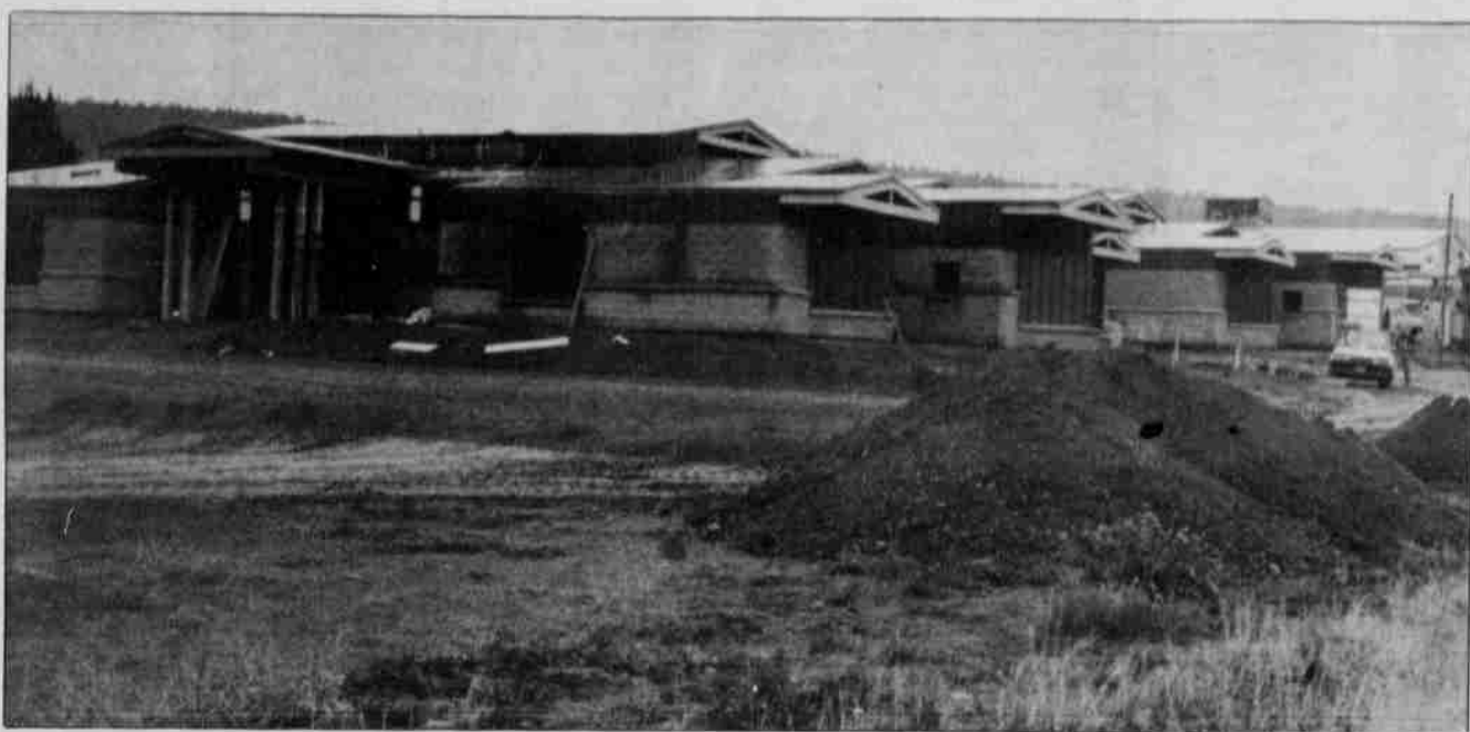
Progress on the Early Childhood Education Center is evident as the building begins to take shape. Completion is expected to be early to mid-1992.