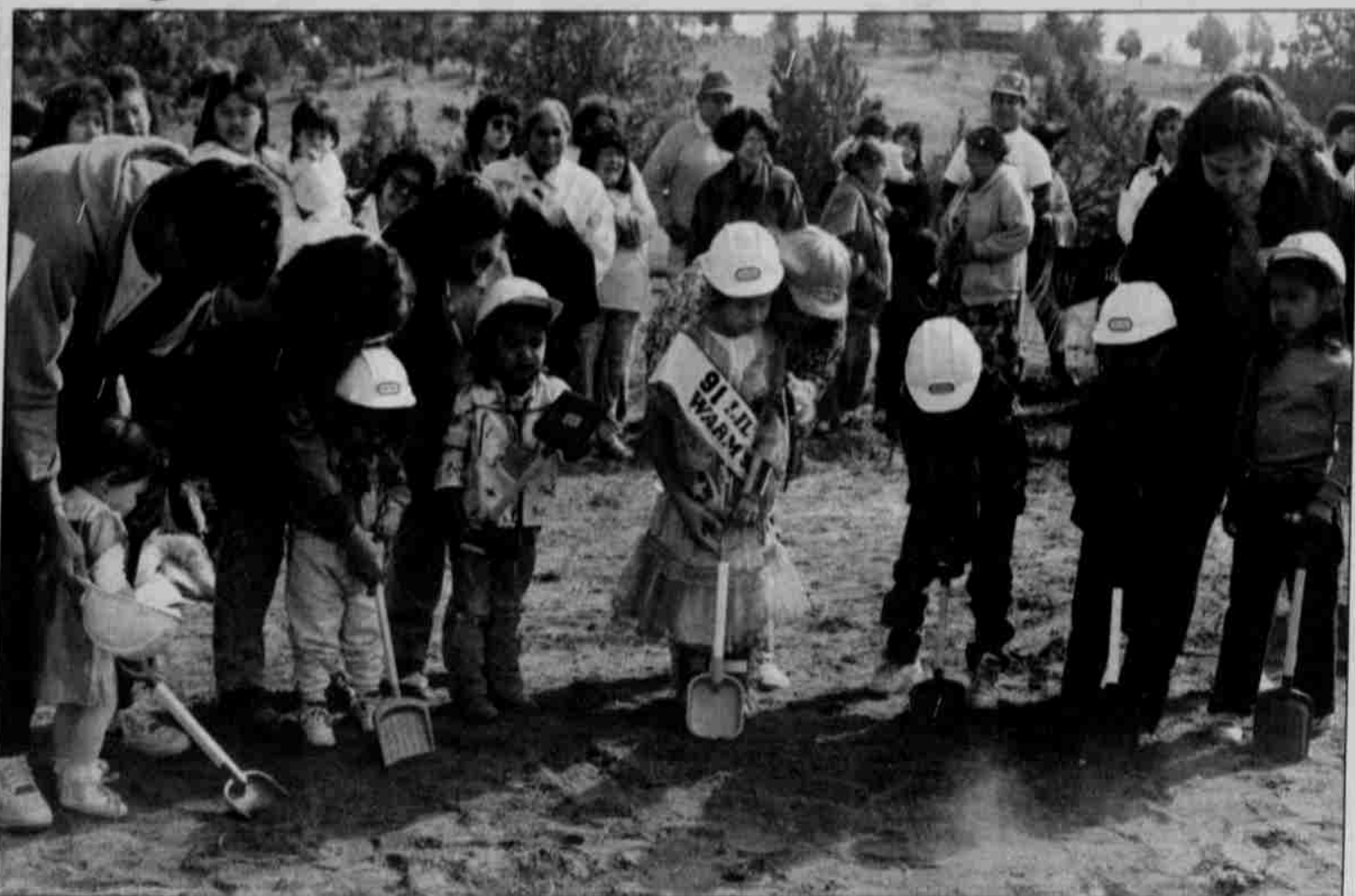
Children were the main attraction at the groundbreaking ceremonies of the new Early Childhood Education Center April 18. The Center will provide space for the care and teaching of 460 children.