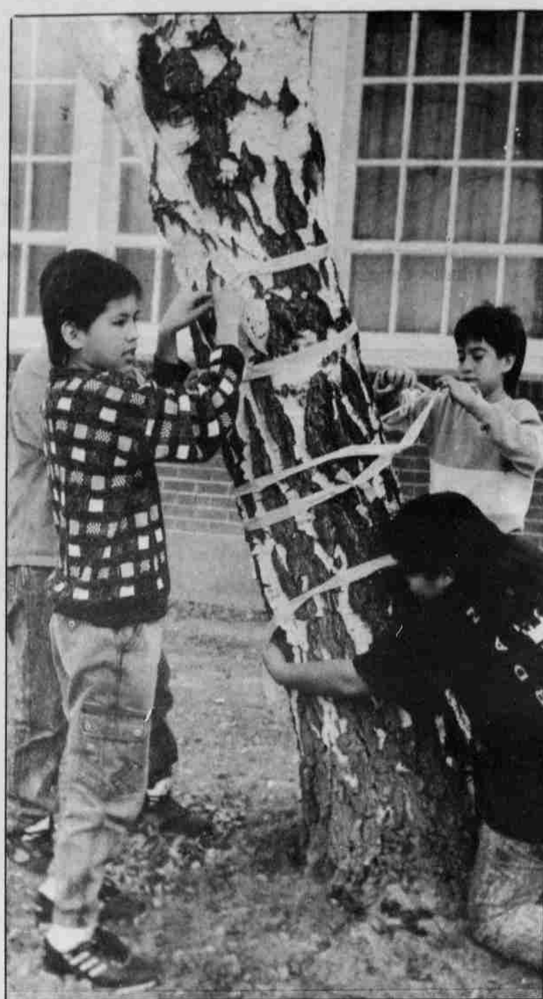
Remembering those in The Gulf, students at Warm Springs Elementary honored the military by tying bright yellow ribbons on different objects throughout the community.