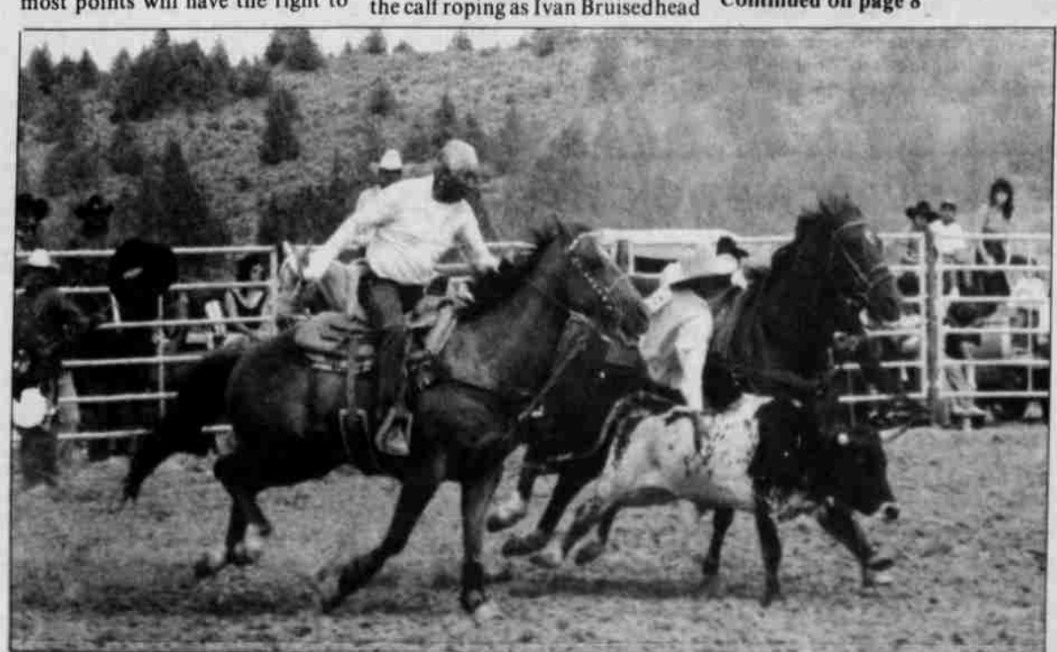
Bulldogging, a fast dangerous sport.