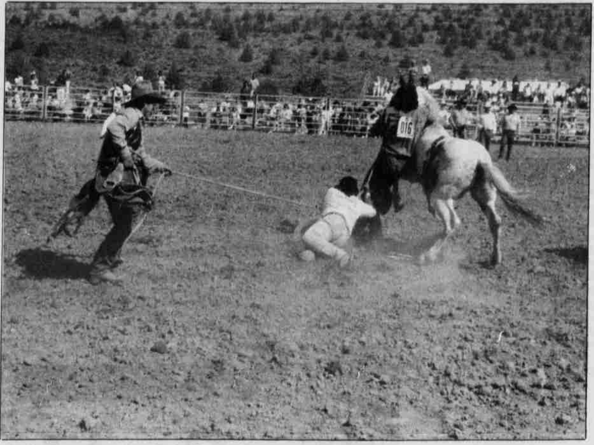
Wild Horse Race provided plenty of excitement at the rodeo.