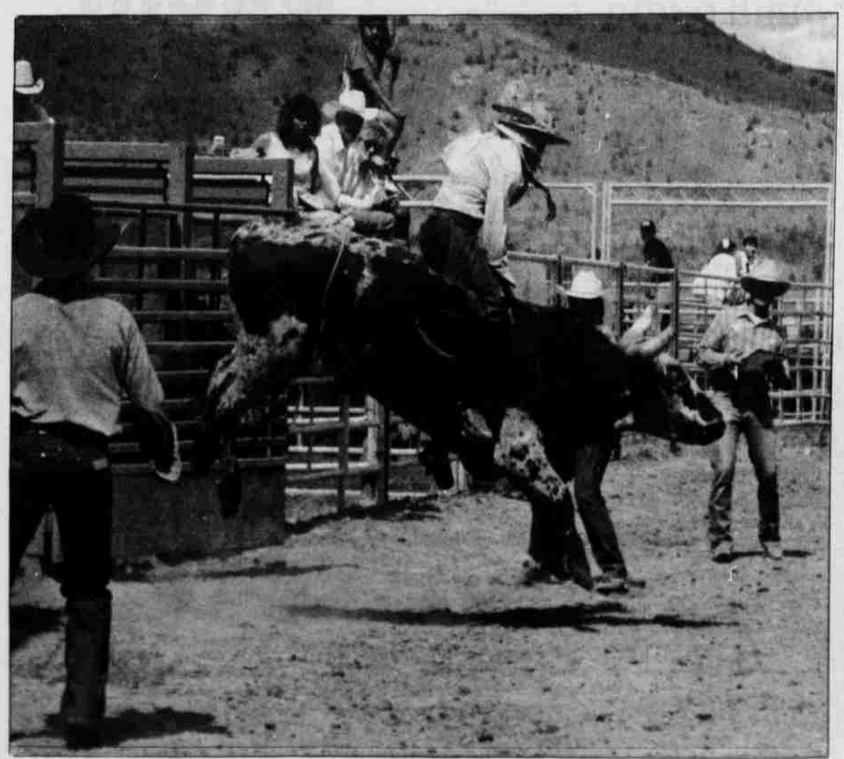
Bullriding event, where there were only 3 qualified rides. These tough bulls bucked a lot of cowboys off.