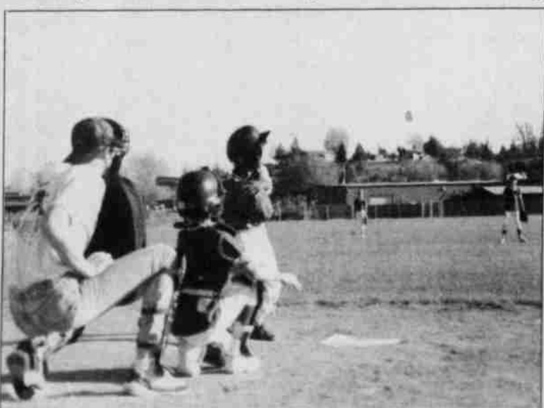
Boys in Little League have plenty of action as the season gets underway. Teams have been organized in Madras, Culver and Warm Springs.