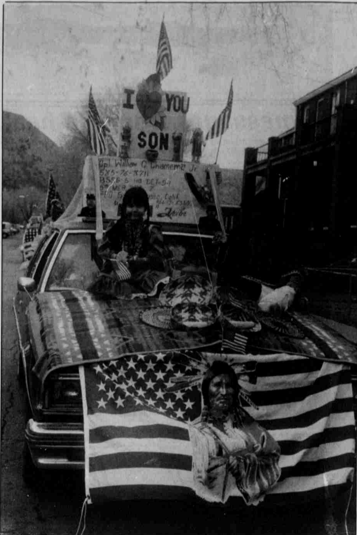
Children, relatives and friends serving in the military were as much a part of the Warm Springs Patriot's Parade, January 25, as were those directly participating.