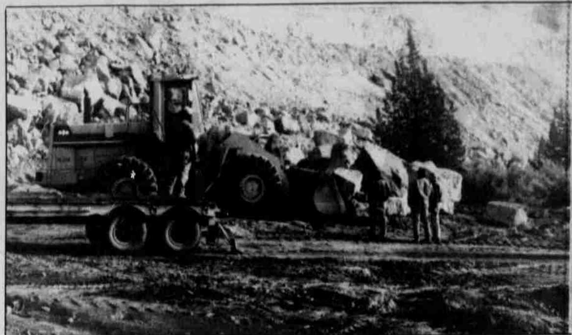
Fossil slabs are removed from excavation site between Warm Springs and Madras.

Three nice fossiliferous boulders sit presently in the state highway