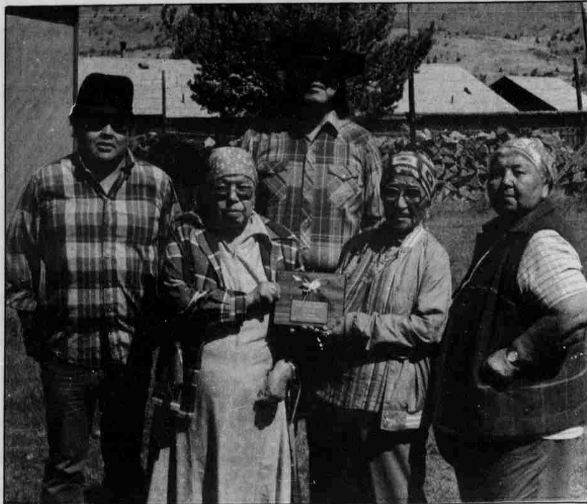
The stickgame champs