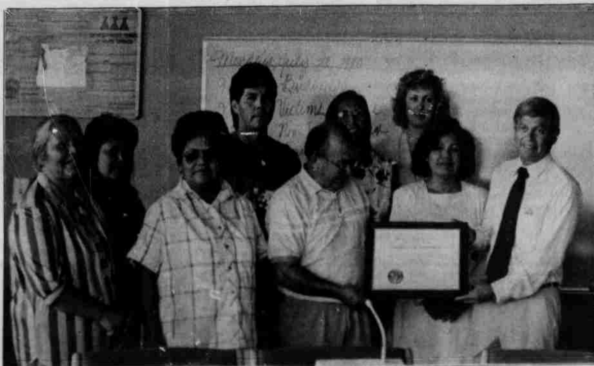
Help for victims