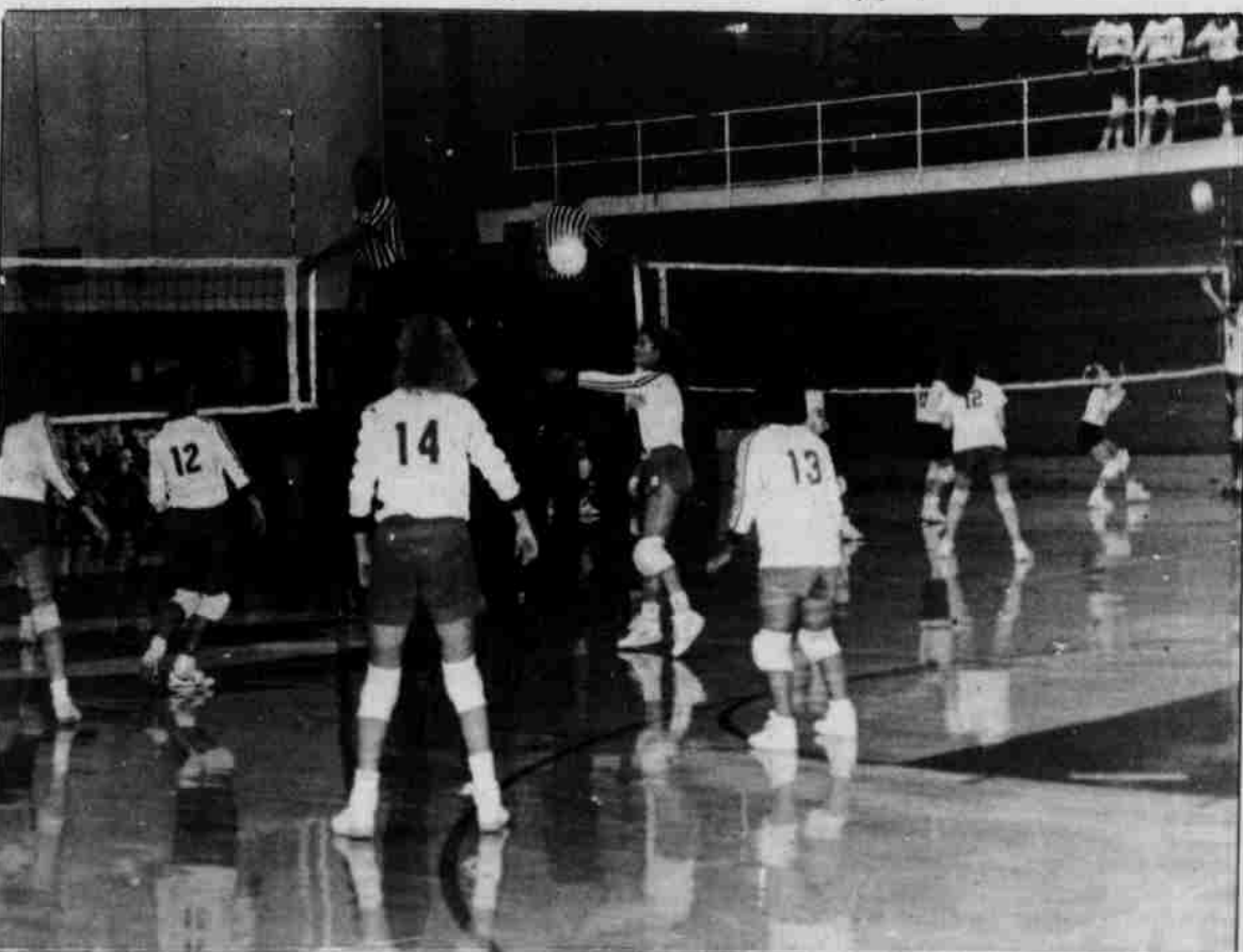
Madras JV Volleyball team returns the ball to Mac-Hi Pioneers during game Friday, September 14, 1990.

How does obesity contribute to heart risk?