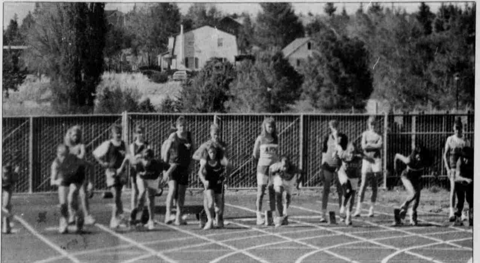
Madras Jr. High girls participated in track events Wednesday, May 9 at Madras High School. The event drew students from various Central Oregon junior high schools. Competition in junior high prepares students for other athletic events as they grow older.