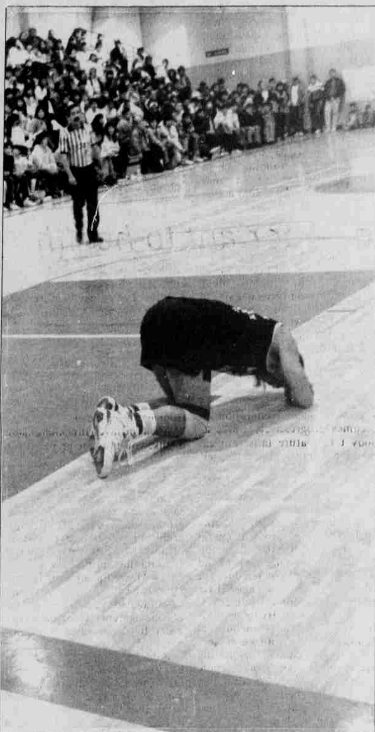
An unidentified Kansas player down with a twisted ankle.