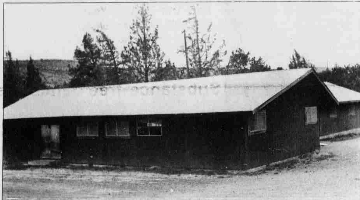
The Full Gospel Church closed its doors after the building was condemned.