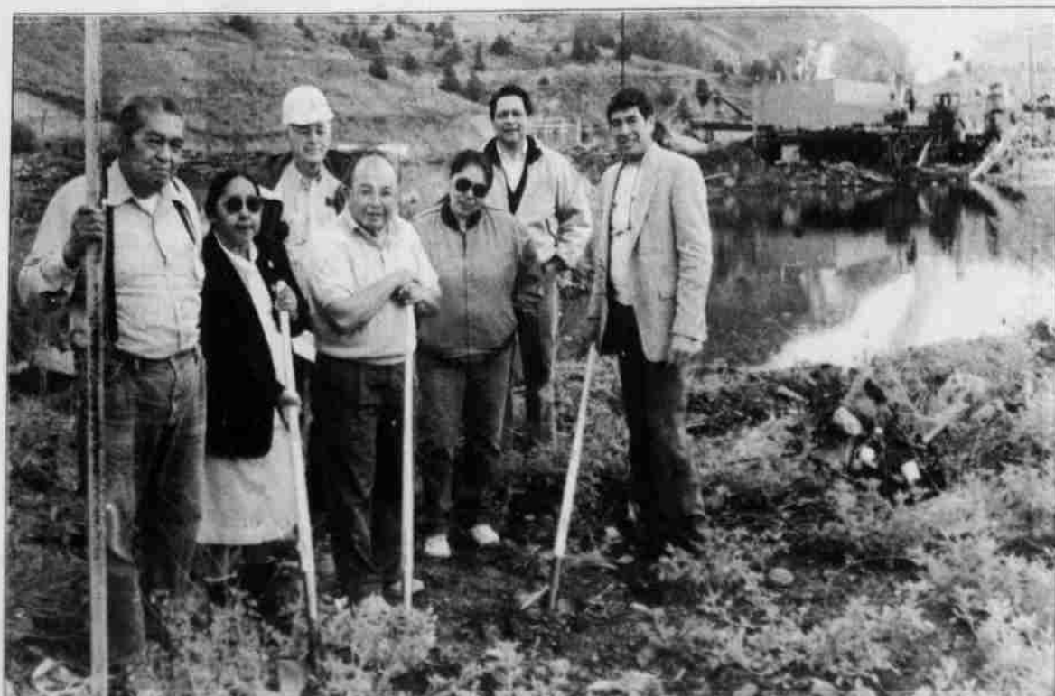
Members of Tribal Council and WSFPI management broke the ground April 28 for the new small log mill.