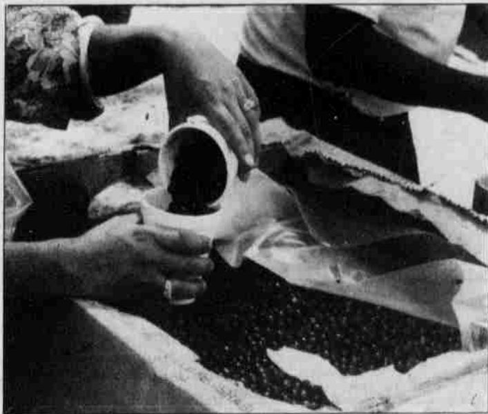
Huckleberries were abundant at the annual Huckleberry Feast held at HeHe.