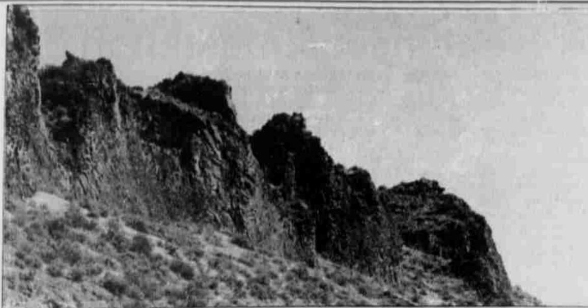
Identify the location of the rock formation in the photograph and win year's subscription for yourself or a friend. Call 553-1644 with your answer.