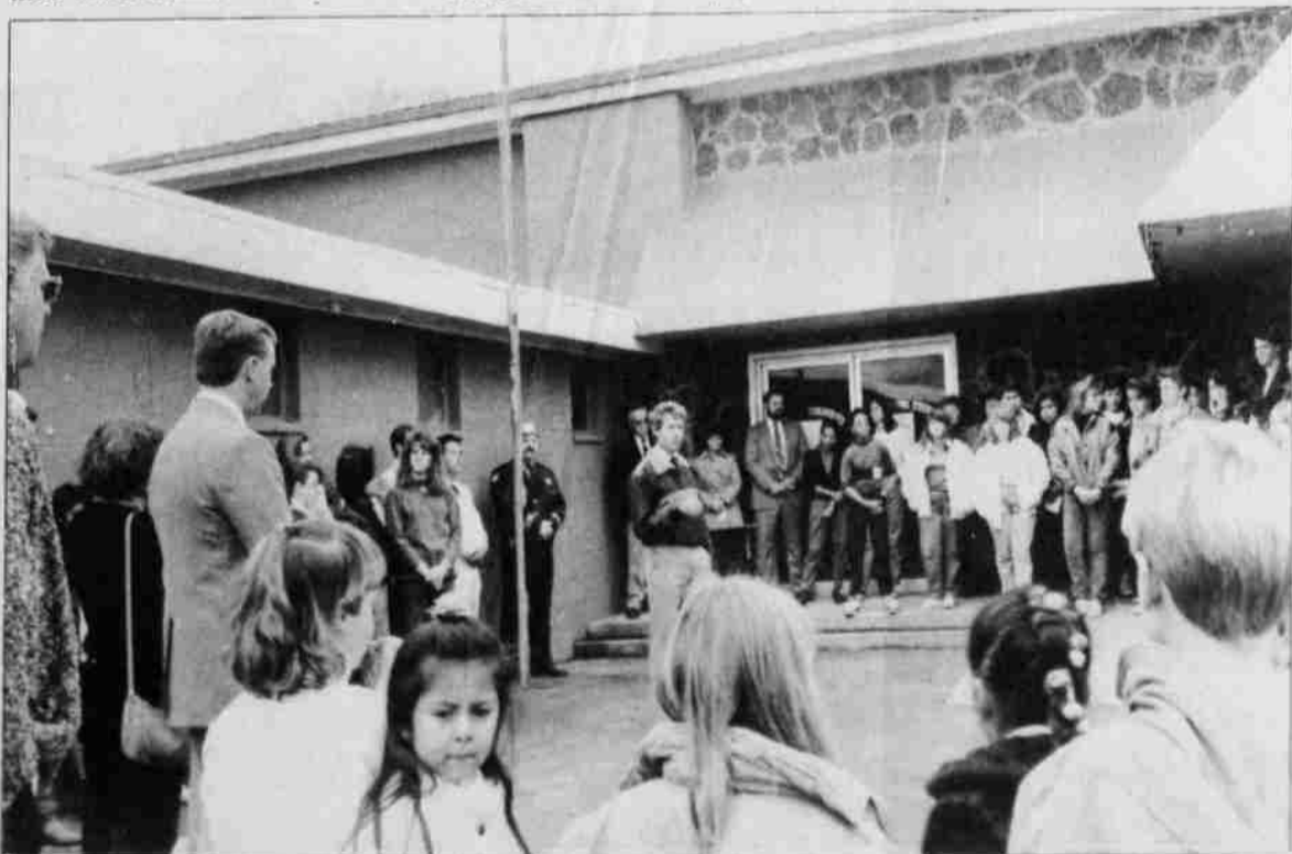
The "Drug-Free Class of 2000" district second graders met in front of the City Hall in Madras, Monday December 4 to hear what the mayor of Metolius, the Sheriff, and others had to say regarding the fight against drugs. The "Class of 2000" has agreed to remain smoke free until the year 2000 when they will graduate. Along with Madras, the communities of Warm Springs, Culver and Metolius have joined together for this cause. The week of December 3 to December 9 has been designated the "Cities Fight Back Against Drugs Week."