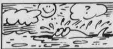
Scientists say the blue color of the sea is due to only to the reflection of the sky.

Wild flowers have been known to bloom in the Arctic—even at the edge of glaciers.