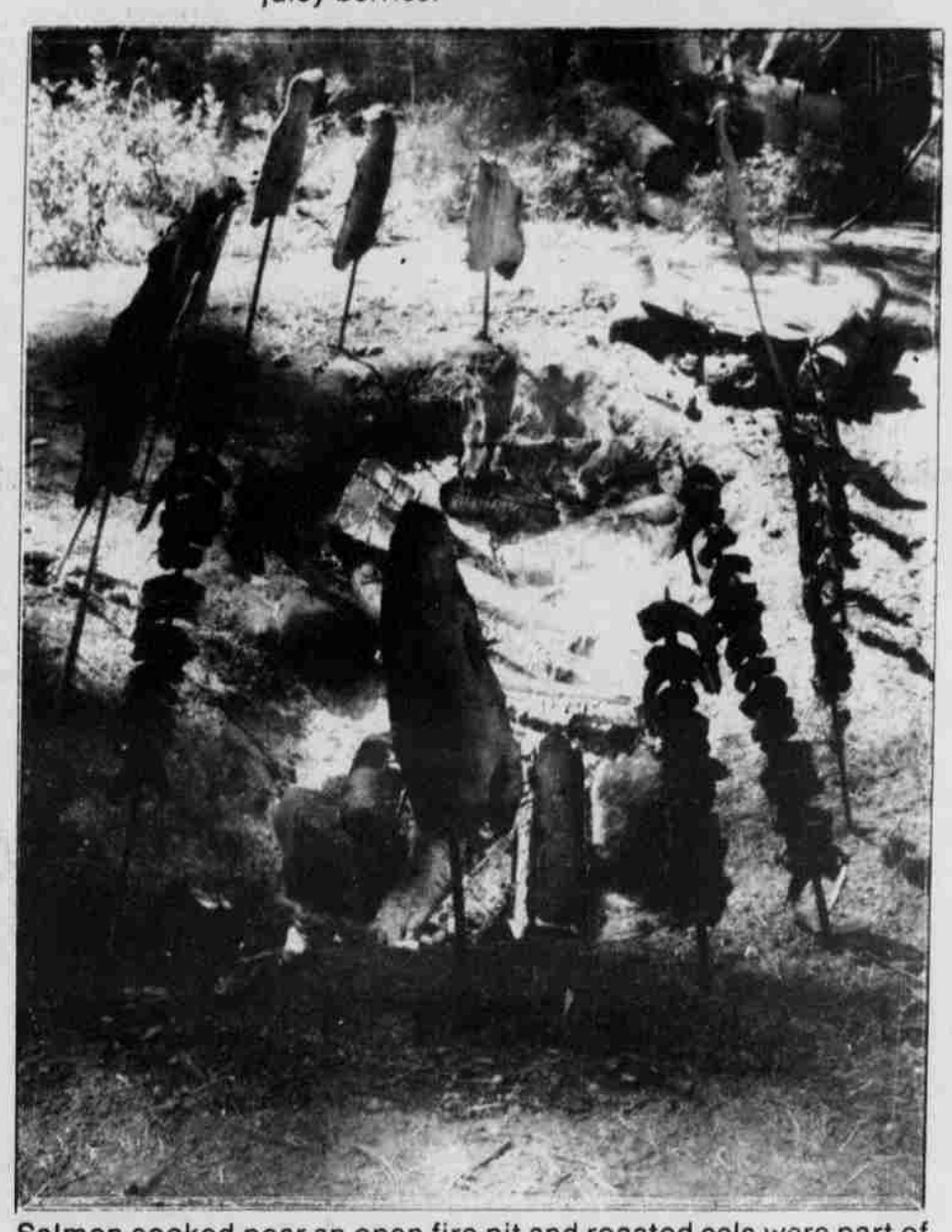
Salmon cooked near an open fire pit and roasted eels were part of the day's fare.