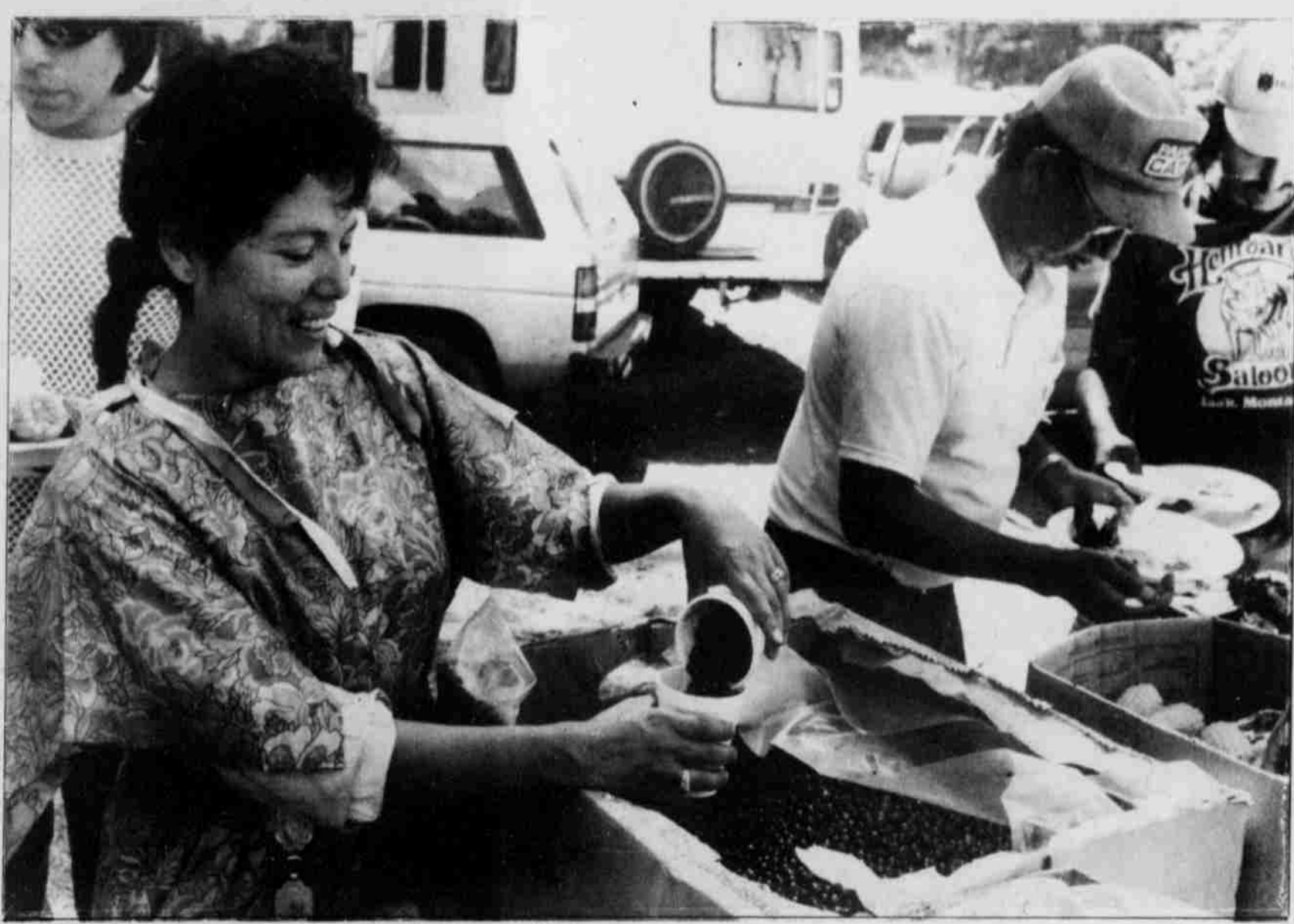
Huckleberry server seemed to enjoy dishing up the large, juicy berries.