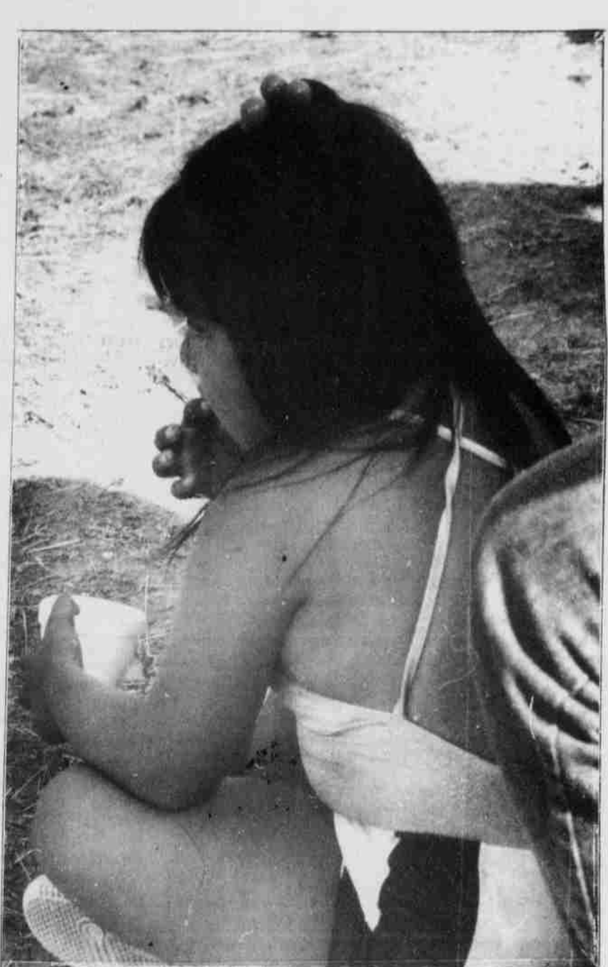
A young rodeo fan quenched her thirst with berries.