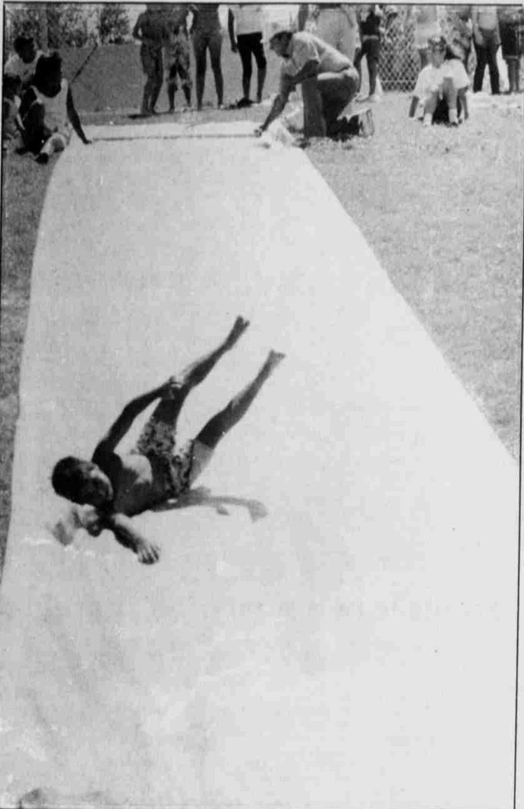
Oops! This youngster came down the water slide all askew. He no doubt got back in line for another try.