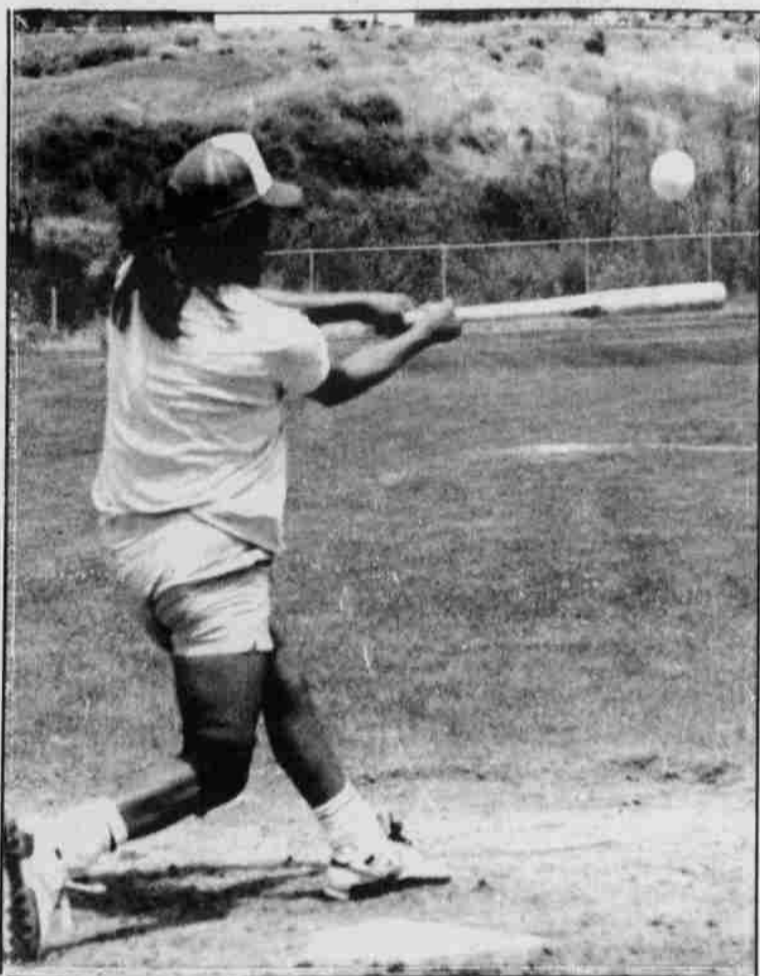
A softball tournament coincided with the Kid's Jamboree Day.