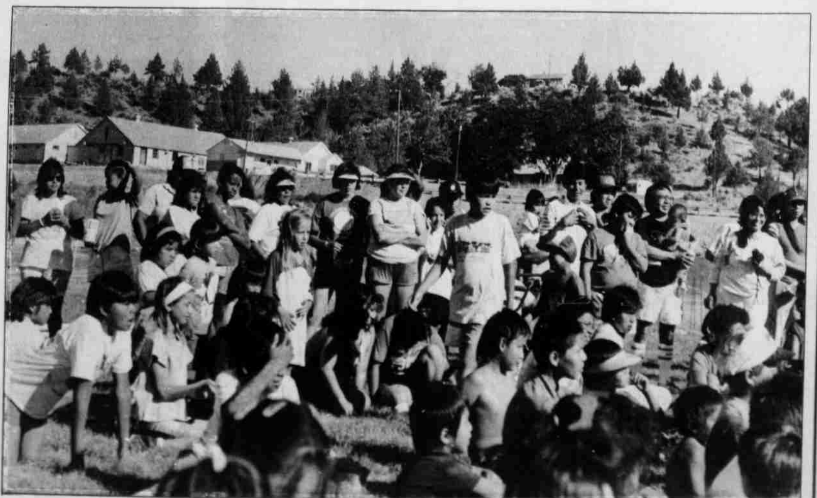
Community members enjoying mud wrestling events.